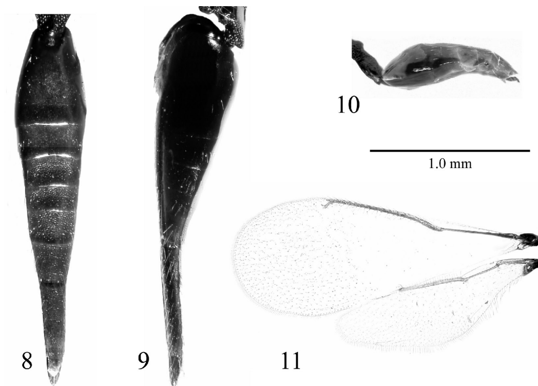
FIGURES 8–11 Paracrias huberi 8. ♀ metasoma, dorsal. 9. ♀ metasoma, lateral. 10. ♂ metasoma, lateral. 11. ♀ left fore- and hindwing, dorsal.

Redescription of the female (Figs. 1, 2, 5, 6, 8, 9, 11). Length 3.0–3.7 mm. Mesosoma dark brown, with dark green and gold metallic reflections (Figs. 5 and 6); gaster dark brown, glabrous (Figs. 8 and 9). Antenna brown. Legs brown, except extreme apices of femora and tibiae pale yellow to white and tarsomeres 1–3 pale yellow to white. Forewing hyaline, veins brown to dark yellow, setae on disk short and sparse (Fig. 11).