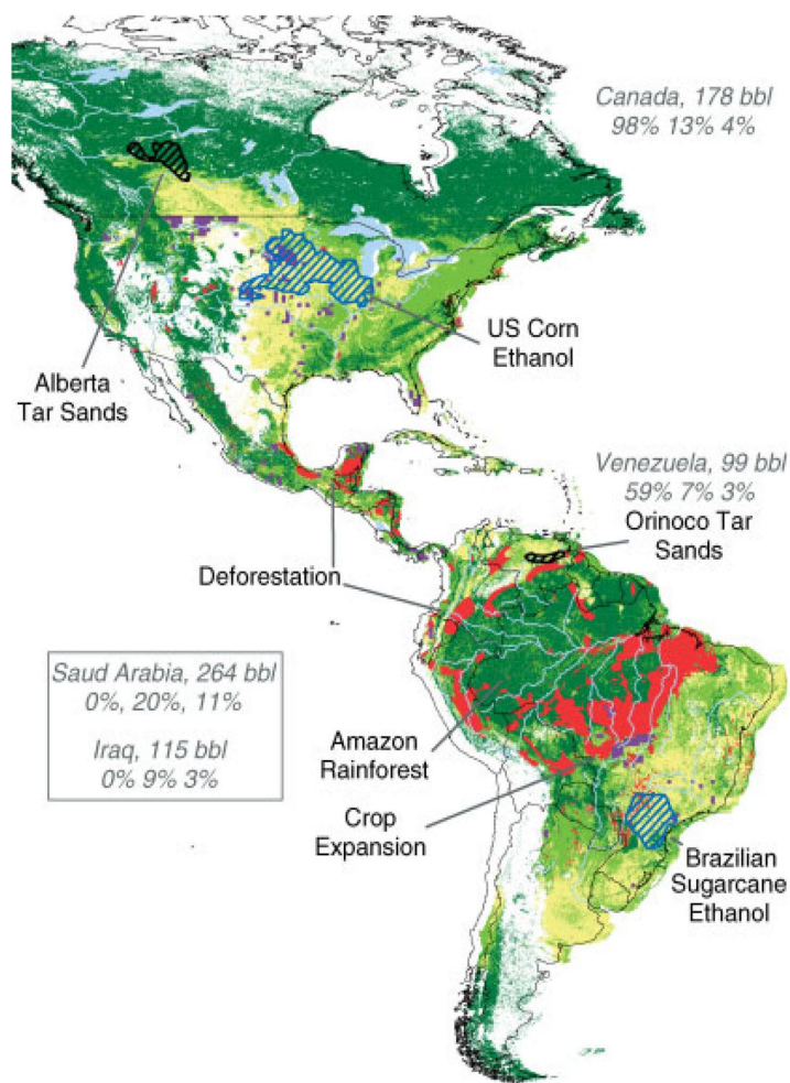
Figure 1. Competition between agriculture and forest reserves in the western hemisphere, and emerging biofuel and fossil fuel resources. Cropping systems (yellow, >30% of area); forests (green, >40% coverage), and overlap (light green). Deforestation (red) from 1980–2000 and crop expansion (purple) from 1980–1990. 14 Country labels: petroleum reserves in 2009 in billion barrels (bbl), and percentages: reserves as tar sands, 2009 global reserves, and 2007 global production, respectively. 57,58 Biofuels only comprise a portion of the designated areas. This stylized map was constructed with GIS data from the Millennium Ecosystem Assessment, http://www.millenniumassessment.org [January 2009].

The ILUC estimates by Searchinger et al. are not implausible, though they are subject to many uncertainties. A previous study by Delucchi 29 estimated that adding ILUC emissions from within the USA to the cumulative emissions intensity of corn-ethanol would increase its GHG intensity by 26%, whereas the ILUC effect from