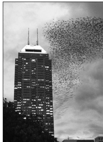
Starlings flying at dusk in front of Chase Tower in downtown Indianapolis, Indiana.

Rome’s leaders decided that the best course of action was not to kill the birds, but rather to harass them. To address the problem, the League for Protection of Birds was hired to harass the starlings in Rome and around the Vatican. The group uses loudspeakers to broadcast recorded starling distress calls and other calls directed toward the birds at their roost each night. Similarly, in the United States, a group of concerned business owners has contracted with USDA/APHIS/Wildlife Services to harass starlings in downtown Indianapolis, Indiana. A combination of pyrotechnics and lasers are used to scare birds from their winter perch. The project to scare off the birds costs downtown