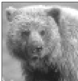
Grizzly bear.

“I wasn’t going to lay down and take it,” Reese