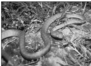
Brown tree snake in the wild.

In December, the Gold Coast Bulletin (Australia) reported that a New South Wales couple was having problems with a computer printer.