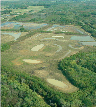
Mechanical excavation increases microtopographic complexity that benefits a diversity of wetland wildlife on WRP sites in the Arkansas River valley.

habitats (Greeson et al. 1978). As part of a comprehensive review of Farm Bill contributions to wildlife conservation (Heard et al. 2000), Rewa (2000a) summarized the literature documenting wildlife response to wetland restoration and made inferences on the contribution of WRP to wildlife habitat potential. That report concluded that while actual wildlife use of WRP sites had not been well documented, the literature on wildlife use of other restored wetlands implies that many species are likely benefiting from WRP wetland habitats. While the lack of program-specific wildlife response data prevented the quantification of species population responses to the program at that time, the variety of wetland habitats established and the predicted wildlife response to these habitats based on studies in the literature implied that the program was providing tangible benefits to individuals and likely benefiting at least some wildlife populations.