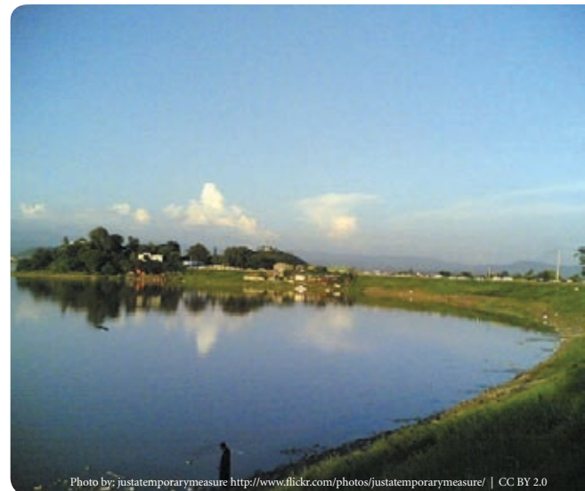
Rawal Dam, Pakistan

Kamal also sees the need to shift from focusing on the provincial distribution of water for agriculture, as in the Sindh-Punjab debate, to developing a comprehensive, better-managed water use program in irrigated and rainfed areas for all of Pakistan. There are