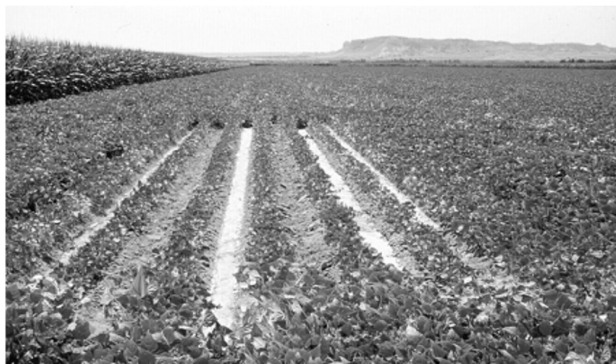
Fig. 2. Effects of compaction on dry bean plant growth at approximately 70 days after planting. Represents a 5 on the vigor rating scale (1 to 5), with 5 being most severe. Note stunting and failure of plants to close rows (<50%) compared with surrounding plots.

Results of contrast analysis illustrating the statistically significant differences attributable to zone tillage effects, and lack of difference among those treatments without zone tillage. The soil resistance values obtained, combined with plant response (disease and vigor ratings; Table 1), indicate that compacted conditions were successfully produced. Those treatments lacking zone tillage had significantly higher soil resistance values, higher disease ratings, and poorer vigor ratings than those including it (Table 1). Individual plants collected from the compacted control treatment were severely stunted with a poorly developed root system, compared with those taken from a zone tillage-