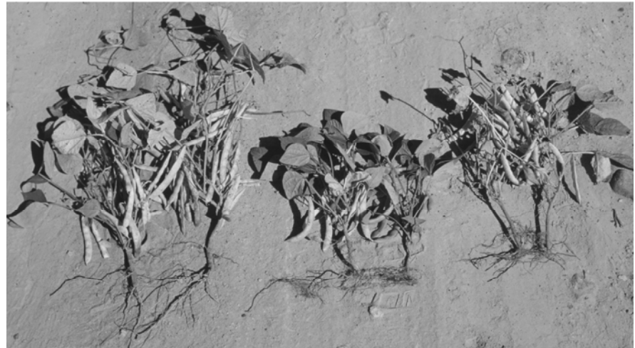
Fig. 3. Effects of compaction and root stress on dry bean plants near harvest (approximately 90 days after planting). From left to right, plants removed from plots treated with: zone tillage, compacted control, and bedding alone, each representing an overall plot vigor rating of 1.0 to 1.5, 4.0 to 4.5, and 3.5 to 4.0, respectively. Note differences in size of plants, number and size of seed pods produced, and degree of root inhibition of plants from non-zone-tillage treatments.

We tried to create a reasonable level of compaction that would simulate field con-