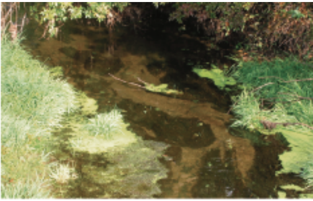
Algal growth in Clear Creek near Columbus.

include as narrow a range of stream size, type, and hydrologic setting as is practical for that region.