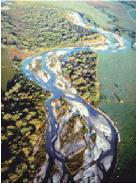
Aerial view of a sandy, braided channel of the Platte River.