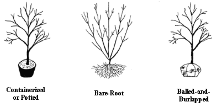
Figure 2. Types of planting stock.

Time and effort should be spent on site preparation prior to planting. Major soil deficiencies should be identified and corrected before planting or a better planting site should be selected. It is especially important to locate all underground utilities before digging. In Nebraska, state law requires that you contact the "digger's hotline." Check the area for subsurface drainage and be certain plant placement will allow for proper growth and development (do not plant large trees under power lines).