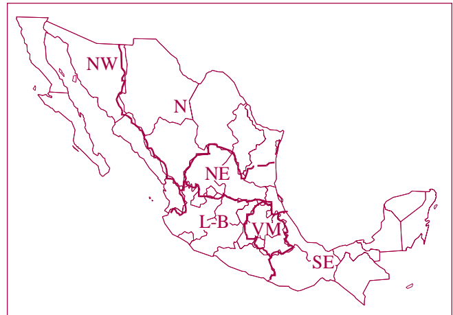
Figure 1. Main hydrogeographic areas of Mexico. NW = Northwest; N = North; NE = Northeast; L-B = Lerma-Balsas; VM = Valle de Mexico; SE = Southeast.

The droughts of recent years have caused acute deficits even in typically humid zones, with adverse effects. During the first half of 1998, wildfires reached historic highs. This was exacerbated by rains in late 1997 that caused greater-than-normal undergrowth. In early 1998, the humidity diminished, and plants dried out and were converted into highly flammable material, increasing the risk of fire. In addition, the