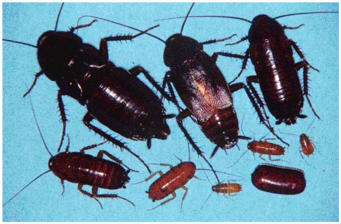
Figure 2. Oriental cockroach.