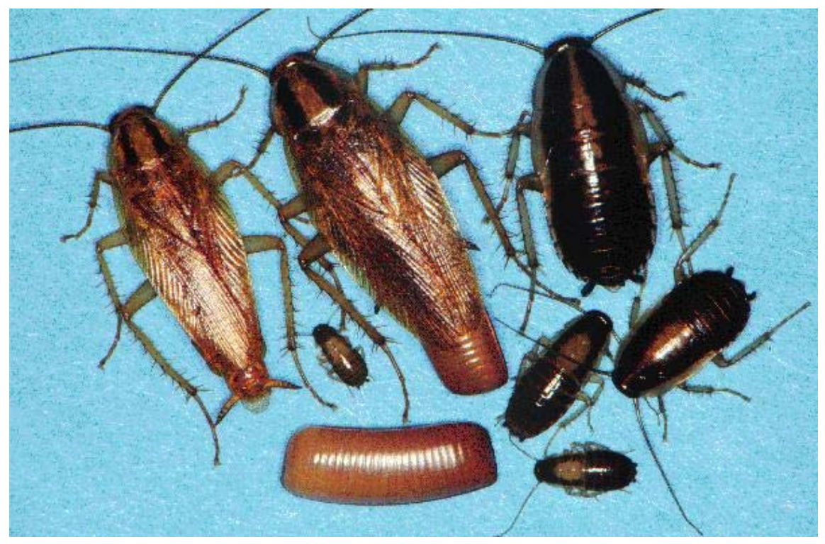
Figure 1. German cockroach.