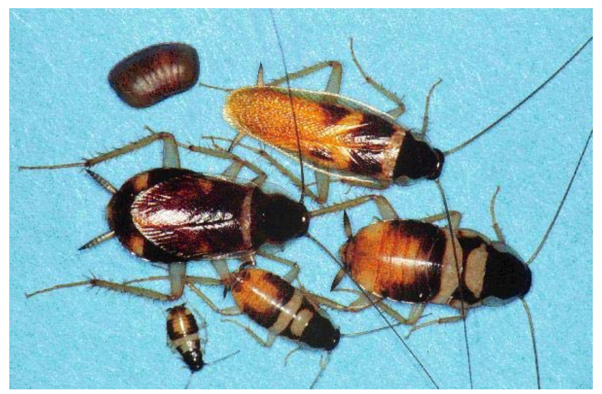
Figure 3. Brownbanded cockroach.