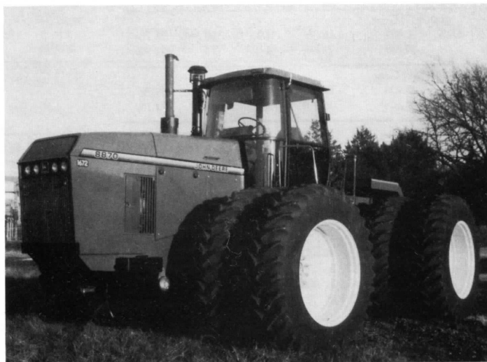
JOHN DEERE 8870 POWRSYNC DIESEL