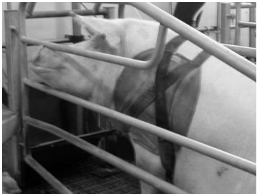
Figure 4. Shoulder pad fixed to a sow in Denmark.

pressure on the tissues in the shoulder. Sows that appear stained or that have indentations of the flooring design on one side probably have been lying on that side for some time. Providing these sows a rubber mat to lie on probably will prevent an ulcer from developing.