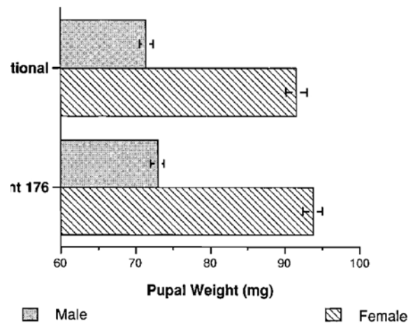
Figure 1. Male and female pupal weights from larvae developing on conventional and Event 176 hybrids. Bars represent standard errors ( N = 146 for Event 176 males, 142 for conventional females, 152 for Event 176 females, and 148 for conventional females).

Pupal weight. Comparisons of O. nubilalis pupal weights are presented in Figure 1, and the results from the analysis of variance are presented in Table 2. Pupal weights did not