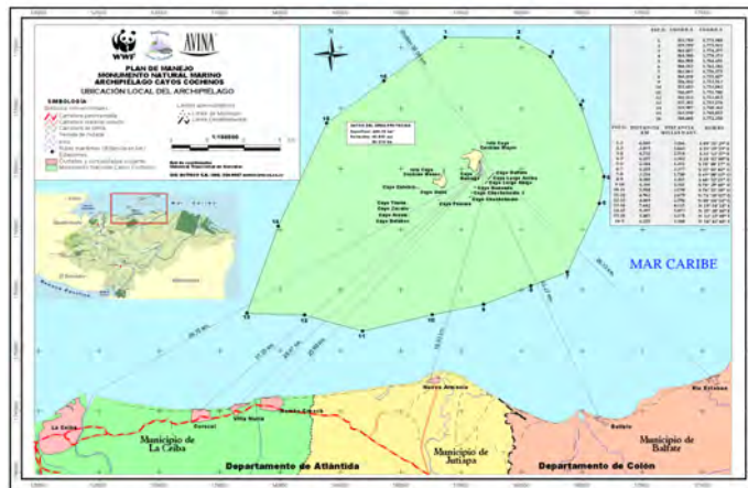
Figure A. Location of the Cayos Cochinos Marine Protected Area