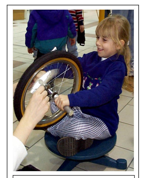
Figure 1. At Science Day at the Mall, a girl learns about angular momentum

Our second major event is participating in Bright Lights, a summer enrichment program for Lincoln area K-12 students. Bright Lights is a non-profit organization that organizes three weeklong sessions throughout the summer on a variety of topics, although there is an emphasis on math, science and computer activities. ScienceWorks has offered a five-day long course on materials science for 4-6<sup>th</sup> graders for the past three summers. The students learn about atoms and molecules by building their own molecules with gumdrops and toothpicks. Later, we discuss material properties such as strength and brittleness, electromagnets, magnetism and thermal conductivity. Students learn by making their own polymers, breaking steel wires and making