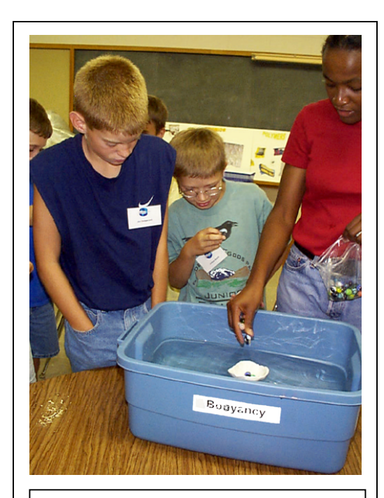
Figure 2. During our participation in Bright Lights, students learn the best design for clay boats so that they hold as many marbles as possible before sinking.