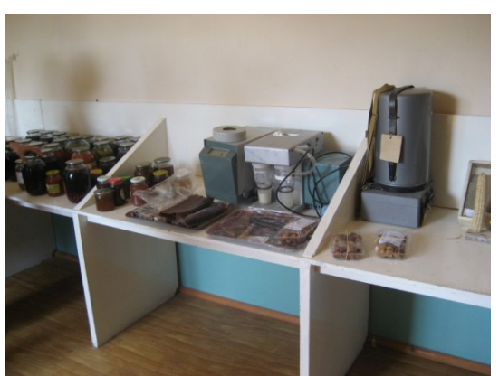
Examples of products