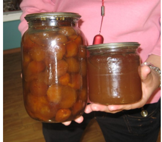
Previous product Jelly as a new product