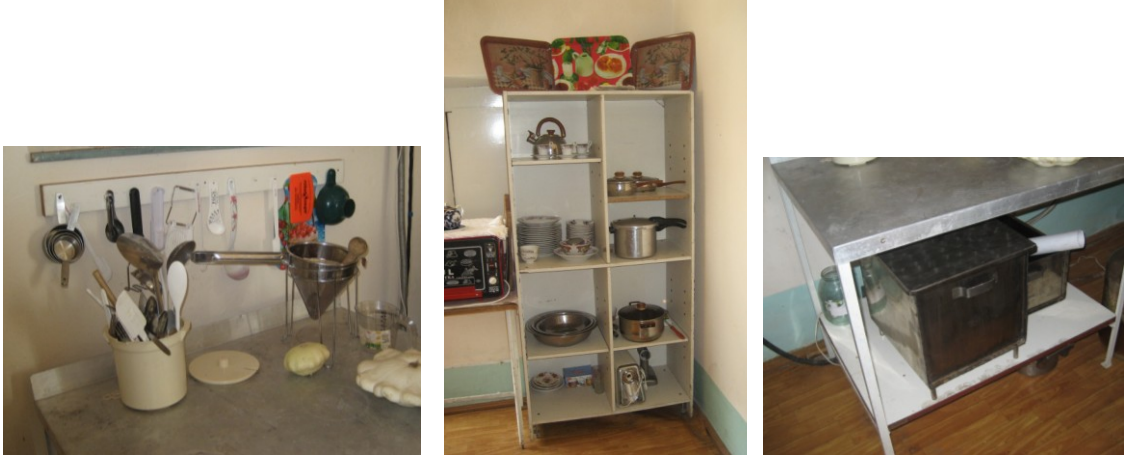
Equipment purchased in the United States for making jams and jellies

Through the grant, the laboratory has been equipped with supplies for working with testing new ways to process fruits and vegetables, and preserve meat (see pictures below). However, the dream of the Deputy Dean of the department is to expand and improve the laboratory to be like those she saw at UNL. But to do this, she will need more supplies and equipment.