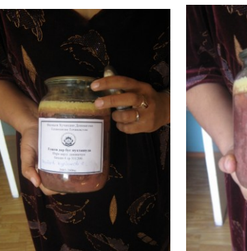
Proper labeling for canned meat