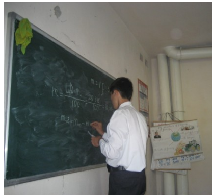
Faculty members using chalkboard with handouts