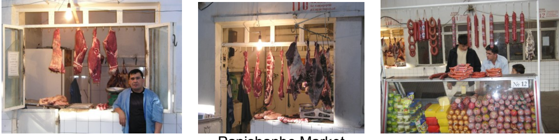
- - - - - - - - - Panjshanbe Market - - - - - - - - - -

In Panjshanbe Market, the areas where fresh meat was sold appeared to be clean and free of insects. The fresh meat hung from hooks; it was not refrigerated and cutting tables were in the aisles among the people. Some sausage was refrigerated. At the New Market, meat was precut on plates in a refrigerated case and was covered with plastic wrap; all sausage was refrigerated (see pictures below).