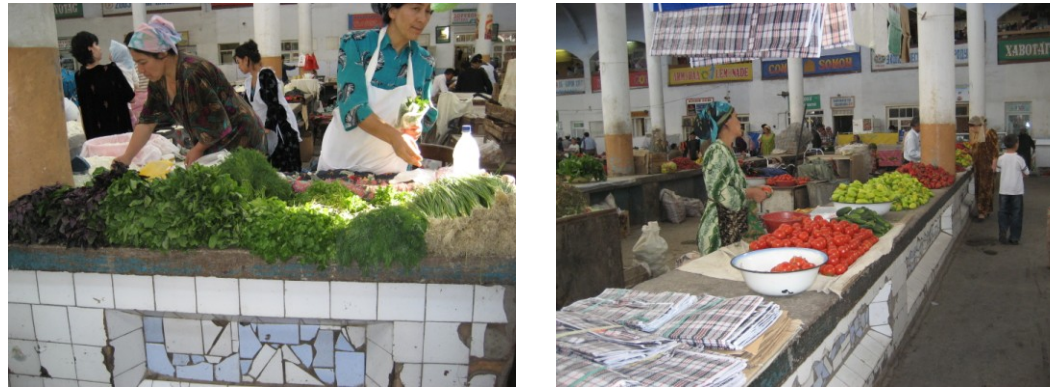
---- Panjshanbe Market ------

At both Markets, the fresh produce had good color and looked fresh. Both places were clean and neat. In the New Market, dairy products were refrigerated; I did not observe dairy products in Panjshanbe Market (see pictures below).