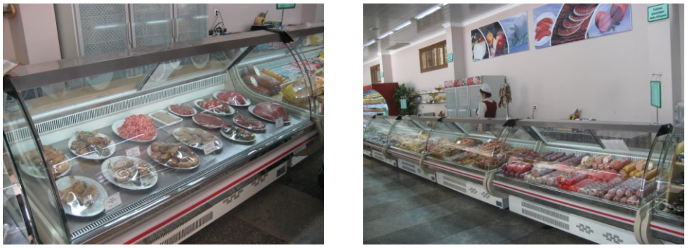
---- New Market -----