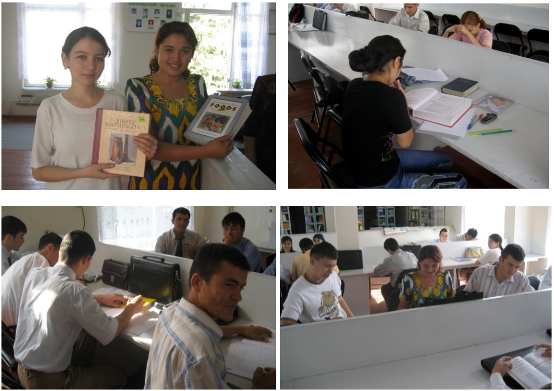
Books were stored near the ceiling in the library in the Faculty of Economy and Business. It was unclear whether or not these books are actually used for classes. When asked about the use of the books, the reply was, "Of course we use them!" It was explained that students are

Students in the library at the Faculty of Informatics and Technology were using some of these books, especially the foods, mathematics, and computer texts.