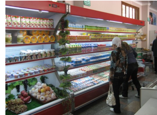
-----New Market ------

Future plans for the New Market. The faculty member would like to conduct research on how to make sambusa safer. He feels it needs to be cooled and then reheated at the time one