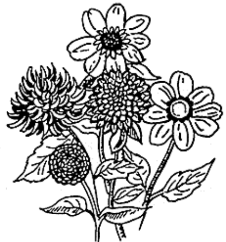
Figure 1. Some popular dahlia types (clockwise from lower left) are: tiny pompon, double cactus (incurved type), collarette, single, and double formal decorative (center).

Perennial dahlias generally are purchased as tuberous roots. Like annual dahlias, perennials are over-wintered indoors as tuberous roots.