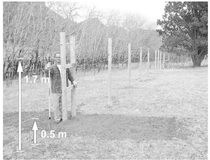
Figure 1. Design of enclosure and deer-ladder stile with paired trackplot to monitor wildlife use.

We used animal-activated cameras (2 inside, 2 outside) from May 2004 through May 2006. We used 2 Wildlife Pro ™ camera systems (Forestry Suppliers, Inc, Jackson, MS) to record still-image photographs of animals within 20 m of the fence inside and outside of the enclosure. We also used 2 StumpCam ™ video camera systems (DixieCam, Kissimmee, FL) mounted on fence posts at another location to record real-time video of animals along the fence inside and outside of the enclosure. Cameras were set up and programmed to photograph deer and larger-sized animals. We identified and recorded the number of animals observed in a photograph or during a video-camera event and tallied the number of animals for each species/month. We estimated differences between mean monthly totals for each species ( \Delta = \bar{x}_I - \bar{x}_O ) for paired observations using PROC TTEST (SAS 2003), where I = inside and O = outside the enclosure.