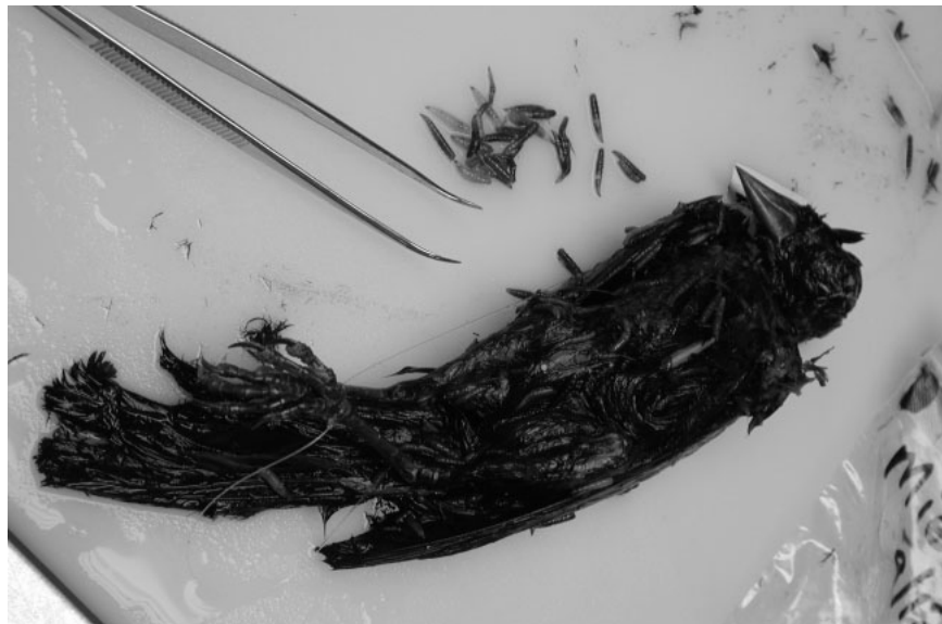
Blackbird dissection and maggot collection were performed at the National Wildlife Health Center, Madison, Wisconsin.

In 2000 we recorded both the status (floating, sunken, or missing) and condition (degree of decomposition—fresh, maggots present, maggot infested, or decomposed) of the carcasses at each monitored stake and opportunistically at other