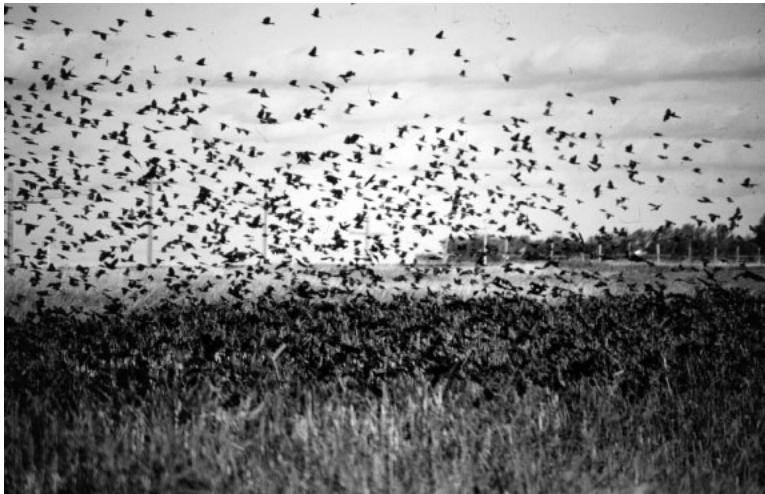
Large numbers of blackbirds typically roost in wetland environments near sunflower fields in the central prairies of the United States.

indicated that conditions were most favorable at Soupir wetland in 2000. Based on environmental conditions in our study wetlands, it appeared the risk of botulism outbreaks occurring in the absence of animal carcasses generally was low, and no botulism mortality was observed in our study wetlands. As a result, it is difficult to determine whether type C botulinum toxin and bird mortality would have been produced in these wetlands under more favorable environmental conditions. If botulism mortality had occurred during our study, it may have been difficult for us to establish whether blackbird carcasses or favorable environmental conditions were responsible for initiating the outbreak.