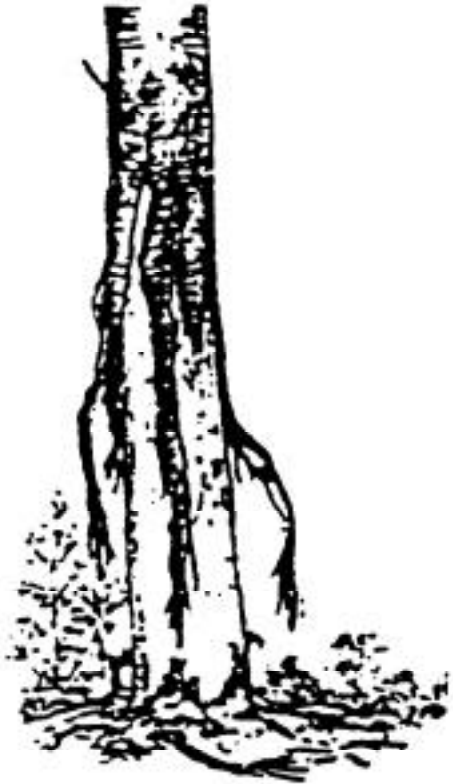
Figure 1. Tree peeled by a black bear foraging for sapwood.