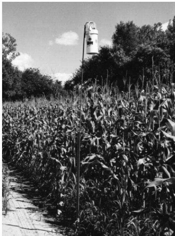
Figure 1. Propane exploder (left) and Electronic Guard (right) on the edge of a cornfield.