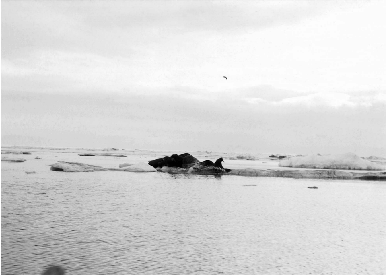
FIGURE 2. Walrus on pack-ice near Barrow, Alaska.

species of the genus Orthosplanchnus Odhner, 1905); 3 species of cestodes of the genus Diphyllobothrium Cobbold, 1858 (a fourth species of that genus was added by Rausch [2005]); an acanthocephalan, Corynosoma validum Van Cleave, 1953; and 2 species of nematodes, Trichinella nativa and Pseudoterranova decipiens . A more carnivorous diet, greater consumption of fishes, and changes in the species composition of the benthic fauna, as noted, may modify the diversity and prevalence of helminth species that are able to persist in walrus.