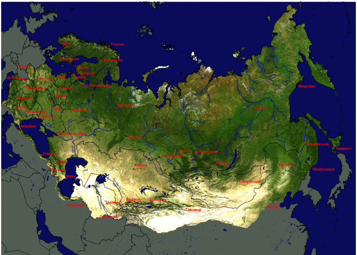
Fig. 1. Northern Eurasia as defined in the NEESPI program. Moderate-resolution imaging spectroradiometer (MODIS) 1 km true color composite from August 20 to 28, 2004 data. Shaded relief adjustment using the Shuttle Radar Topography Mission (SRTM) GTOPO30 elevation data set compiled by USGS EROS Data Center. Shades of green correspond to vegetated land. Light brown and yellow indicate sparse vegetation and arid areas. Water bodies are shown in blue. Grey areas correspond to land surfaces outside the NEESPI study area. Produced by Dr. Mutlu Ozdogan (NASA GSFC). (For interpretation of the references to colour in this figure legend, the reader is referred to the web version of this article.)

systems and the coastal zone, and may have significant societal impacts. The NEESPI covers a vast area with numerous geo-botanic zones from arctic to forest to steppe and arid. One of the reasons the NEESPI geographic domain is important for global change studies is because about quarter of the world's forests are located in Northern Eurasia. Fires, insect invasions leading to defoliation, and forest exploitation by humans are the major disturbances in these forests. Interactions between these disturbances and climate variability are complex, with consequences for carbon dynamics, which have yet to be well understood. In the non-boreal zone of Northern Eurasia, other aspects of LCLUC, such as changes in water resources and carbon emissions following institutional changes and the shifts in agricultural practice, come into play. The paper describes expected results that should come out in about 2–3 years and the future directions the program is taking.