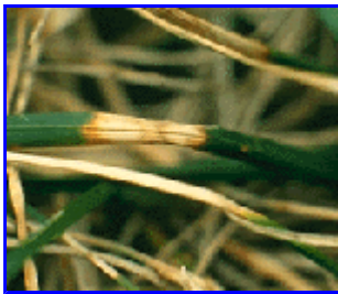
Figure 3. Dollar spot leaf lesions.