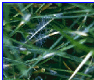
Figure 4. Cobwebby mycelial growth of the dollar spot pathogen.