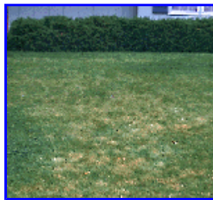
Figure 2. Patches of blighted Kentucky bluegrass on a residential lawn.