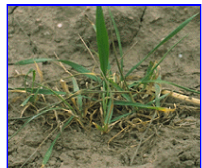
Figure 4. Close-up of pale western cutworm damage to wheat. Note the dead and dying tillers.

In alfalfa, army cutworms will feed at the soil line on the developing new leaves just as they are emerging. Alfalfa should be monitored as it is breaking dormancy and beginning to grow. Any delay in green-up is a sign of problems, and the cause should be determined immediately. If cutworms are present, thorough sampling is required to identify the extent of the problem throughout the field and the average density of the cutworms.