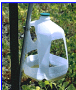
Figure 6. Pheromone trap used to monitor pale western cutworm moths.

Pheromone sources can be obtained from Great Lakes IPM, 10220 Church Road NE, Vestaburg, MI. Light traps collect a number of other species of moths and other insects, making moth identification difficult. If traps are used they should be set up in mid-August and monitored through September.