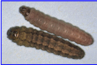
Figure 2. Larvae of the army cutworm (bottom) and the pale western cutworm (top).

Generally, larvae of the army cutworm have a pale grayish body color that is splotched with variable white or light markings ( Figure 2 ). The upper surface is lighter with a pale stripe along the center of the back. There is a lighter band along the side of the larvae below the spiracles. Larvae can attain lengths of 1 1/2 to 2 inches when fully grown.