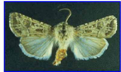
Figure 3. Adult pale western cutworm.

Pale Western Cutworm: The pale western cutworm is primarily a problem in winter wheat. However, it can cause problems on several other crops, including sugarbeets, corn, alfalfa and other small grains. Its host range is very broad, even including many weed species. It is a subterranean cutworm in that it primarily feeds below the soil surface. The depth at which it feeds is regulated by the moisture line in the soil. These cutworms avoid moisture and stay just above this moisture line. Under wet conditions the cutworms will actually come to the surface and feed on the above-ground part of plants. This activity increases the rate of predation by birds and other insects, and parasitization. Increased moisture at the surface also increases disease incidence in the population.