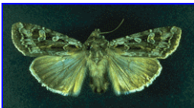
Figure 1. Common adult color form of the army cutworm.

Army Cutworm: The adult army cutworm moth has a wing span of about 1 1/2 inches and is typical of the "miller moths" that are commonly observed. The moth has five color forms, ranging from a lighter form with fairly distinct wing markings to a darker melanic form with less distinct wing markings. The form in Figure 1 is most common. Female army cutworm moths lay their eggs directly onto soil. They seem to be attracted to bare areas such as overgrazed pastures, alfalfa stubble, stressed grassy areas, and newly planted or tilled cropland. Females lay from 1,000 to 3,000 eggs from late August until late October. The result of this extended ovipositional period is a great variation in larval size within fields.