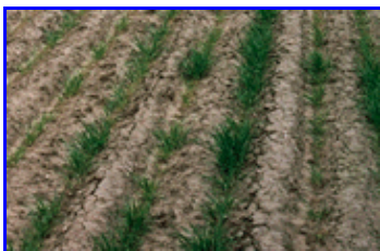
Figure 5. Pale western cutworm damage in wheat field.

Pale Western Cutworm: The first step in managing the pale western cutworm is to determine the potential for outbreaks. Several factors influence the population growth of this insect. It has been found that during wet springs, pressure from parasites, predators and disease causes populations to decline sharply. The number of days with at least 0.25 inch of rainfall ("wet days") is used to determine the potential impact of rainfall on the pale western cutworm population. If 12 or more "wet days" occur during the spring (March-June), the pale western population will be reduced to the point that it will take two or more dry springs to allow the population to rebuild to significant levels. If there are 10 or fewer "wet days," the pale western cutworm population is likely to increase, and the potential for damage the next year is increased.