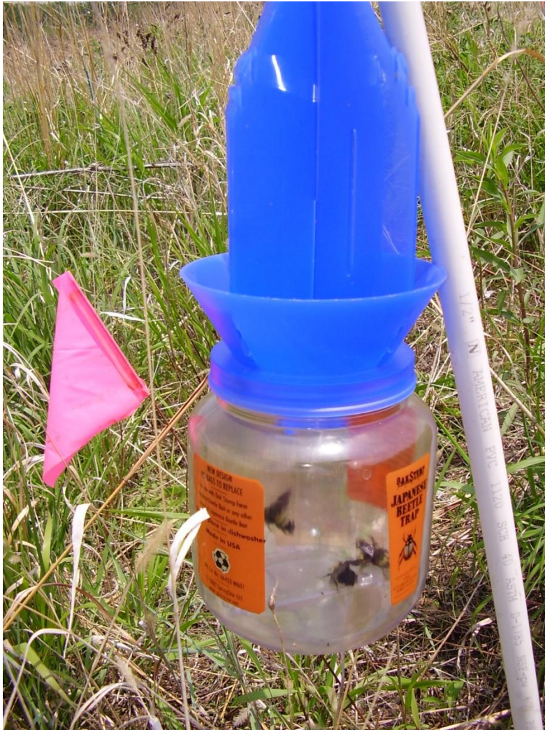
Figure 2. Blue vane trap used to collect wild bees in 2009 (SpringStar™).