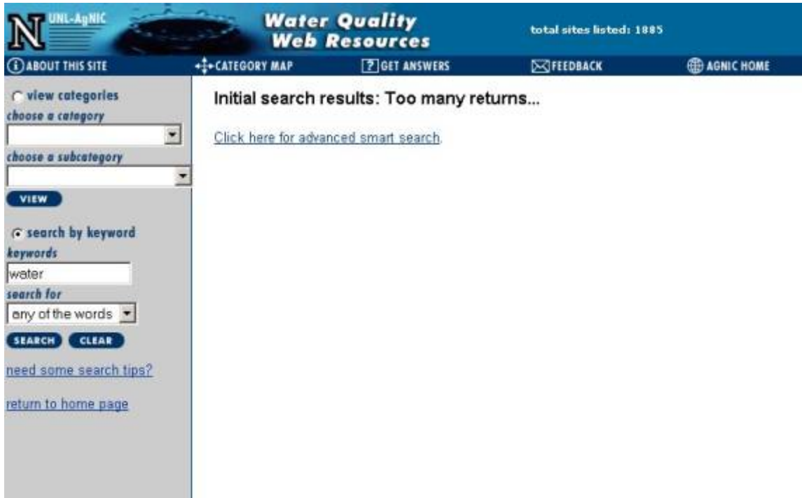
2. Results of “failed” search.