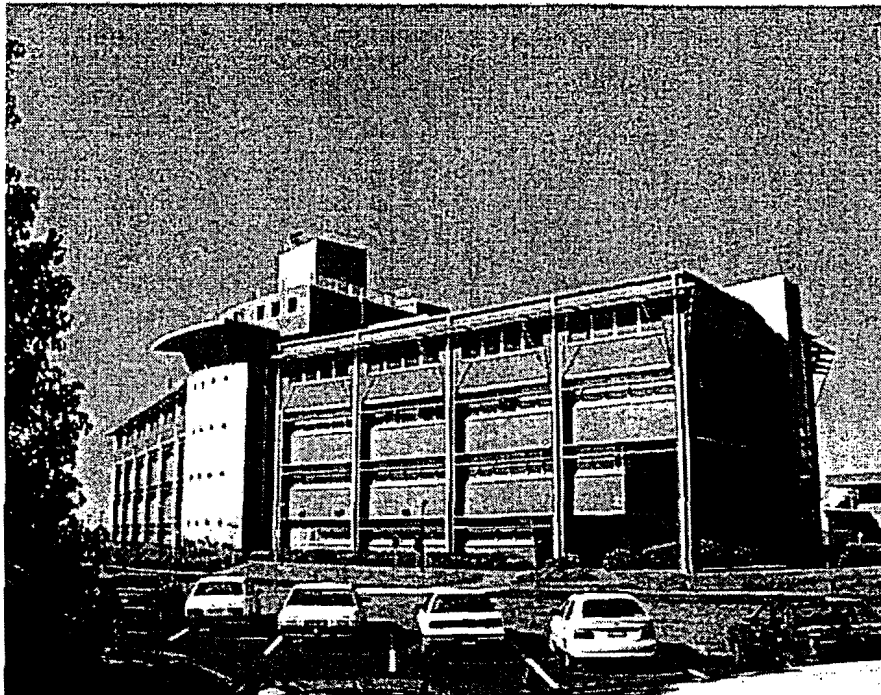
Figure 4 – New Surveying and Engineering Building at USQ

The Engineering and Surveying building was built two years ago and is equipped to the highest standard of facilities. All rooms are air-conditioned and the Surveying discipline ensured that their amenities were first class (see figure 4). From the ground floor, where the survey store is situated, through the third floor where several computer labs are set upright up to the roof which is set up particularly for geodetic observations, the new building serves the surveying discipline well.