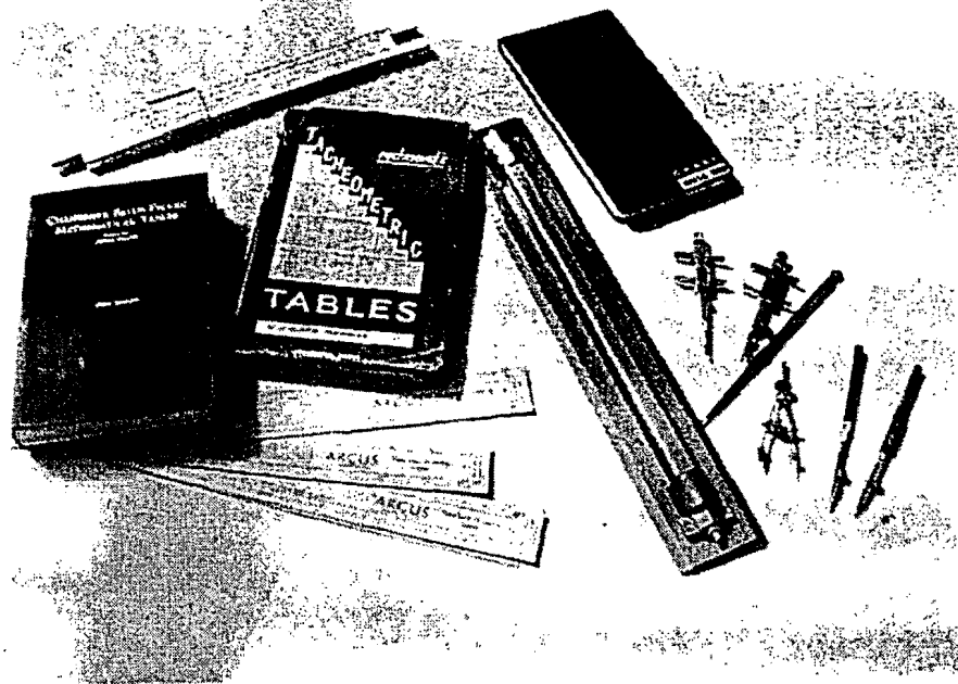
Figure 3 – Typical drafting and Calculating Facilities in the 1960's

At this time all measurements were in links and chains. Plans were generally at interesting scales such as 1 chain to the inch and 2 chains to the inch.