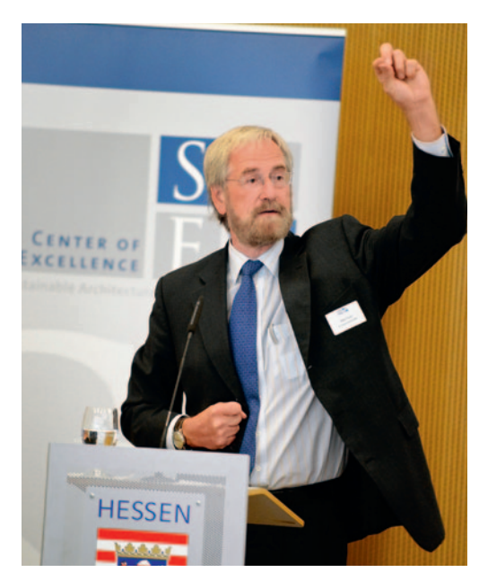
Peter Praet, giving the keynote address.

Peter Praet, member of the Executive Board of the European Central Bank, opened the day with a keynote-address on the role of the ECB in the handling of the financial crisis. Praet asked the question whether central banks have gained