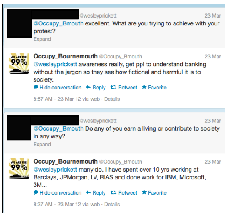
Figure 4. Conversation between @wesleypickett and @OccupyBmouth on Twitter about the goal of their occupation at Bournemouth University. Captured on August 2, 2012

strategic, planned communication. The content of the tweets therefore displays different themes compared to the previous account and they are mostly related to the definition of the Occupy movement and Occupy Bournemouth which includes dissociations from negative representations, the mission of their occupation of Bournemouth University, and awareness raising by seeking approval and support via RTs of celebrities, media and other occupiers.