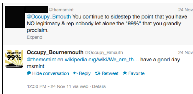
Figure 5. Conversation between @themsmt and @OccupyBmouth on Twitter about the goal of their occupation at Bournemouth University 15

The two twitter accounts capture the history and development of the occupation of Bournemouth including that of Bournemouth University over a half year. They provide a glimpse into the daily life of occupiers from fighting with cold to facing legal action and to trying to raise awareness to their cause while dismissing negative associations. However, the two accounts also show an ad-hoc approach to communication albeit a good sense of social media engagement and etiquette. Despite the good effort, both accounts are currently abandoned and no updates have been sent from either of them for months. This raises questions about effectiveness of online and social media communication for activist and/or protest purposes which will be addressed later in this paper.