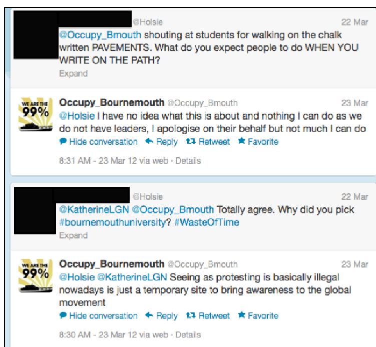
Figure 3. Conversation between @Holsie and @OccupyBmouth on Twitter about the protest and occupation at Bournemouth University. Captured on August 2, 2012.