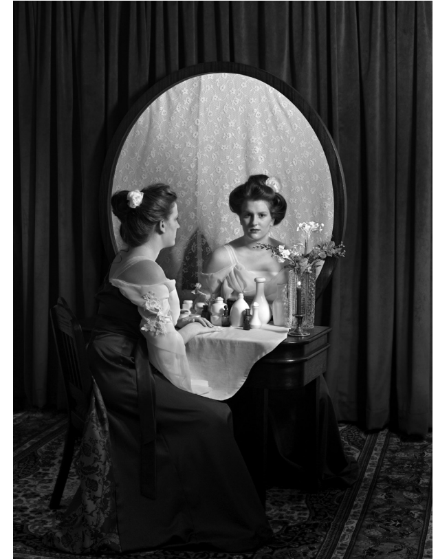
All is Vanity 2009 Video Silent, Colour 00:11:46h