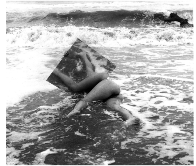
La Ventosa 1/8 1972 Silver print 14 x 14 inches

Breder's artistic practice has always been focused on Intermedia, which is for the artist a way of showing the world, placing himself between different places and cultures. Every artwork produced in any medium is related to an ineffable experience of Breder's life; thus the lifelong interest in the issues of consciousness and perception beyond appearances. Hans Breder was born in Herford, Germany, in 1935 and studied at the Hochschule für Bildende Künste in Hamburg before moving to New York in 1964 when awarded of the fellowship Studienstiftung des Deutschen Volkes. In 1968 he founded the MFA Intermedia and Video Art Program at the University of Iowa and co-founded the Center for the New Performing Arts. He retired from teaching in 2000 and was awarded an honorary doctorate from the University of Dortmund in 2007. Among the places his works are collected are the National Gallery of Art, Washington D.C., the Whitney Museum of American Art, New York, the Museum Ostwall, Dortmund, and the Hirshhorn Museum and Sculpture Garden, Washington D.C..