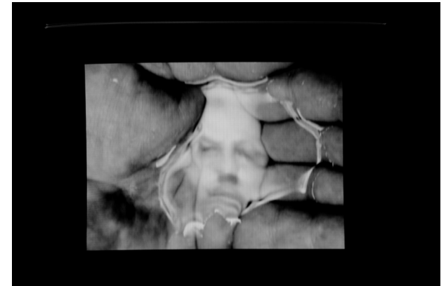
Line of Destiny 2006 Video Silent; Black and White 00:01:59h