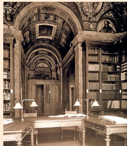
Part of the Bibliotheca Hertziana in the Palazzo Zuccari, Rome

All three lecture series remain to this day important elements of the Academy's programme of events.