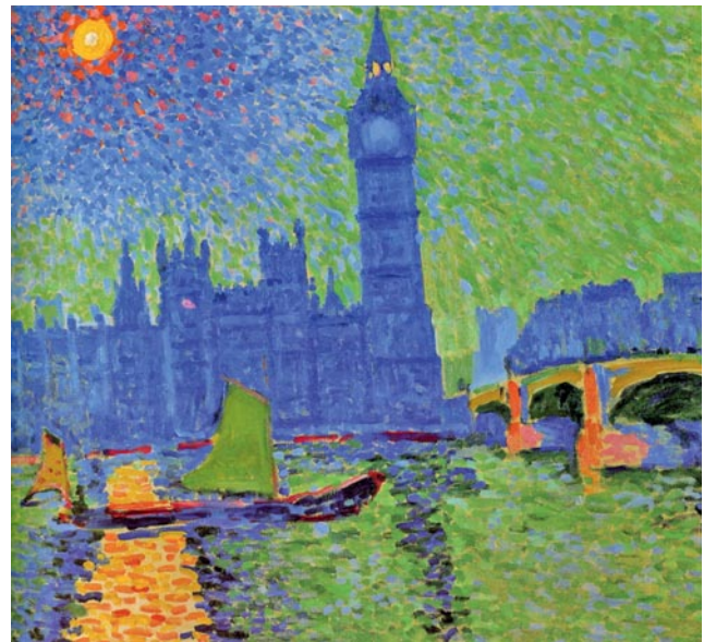
Figure 1. (Above) Works by André Derain, one the painters discussed in John Golding's 1980 'Aspects of Art' Lecture: Self Portrait (1904); Big Ben (1905-6). John Golding (1929-2012) was a Fellow of both the British Academy and the Royal Academy; his Arco Iris (1991-2) hangs on the walls of the British Academy (below).