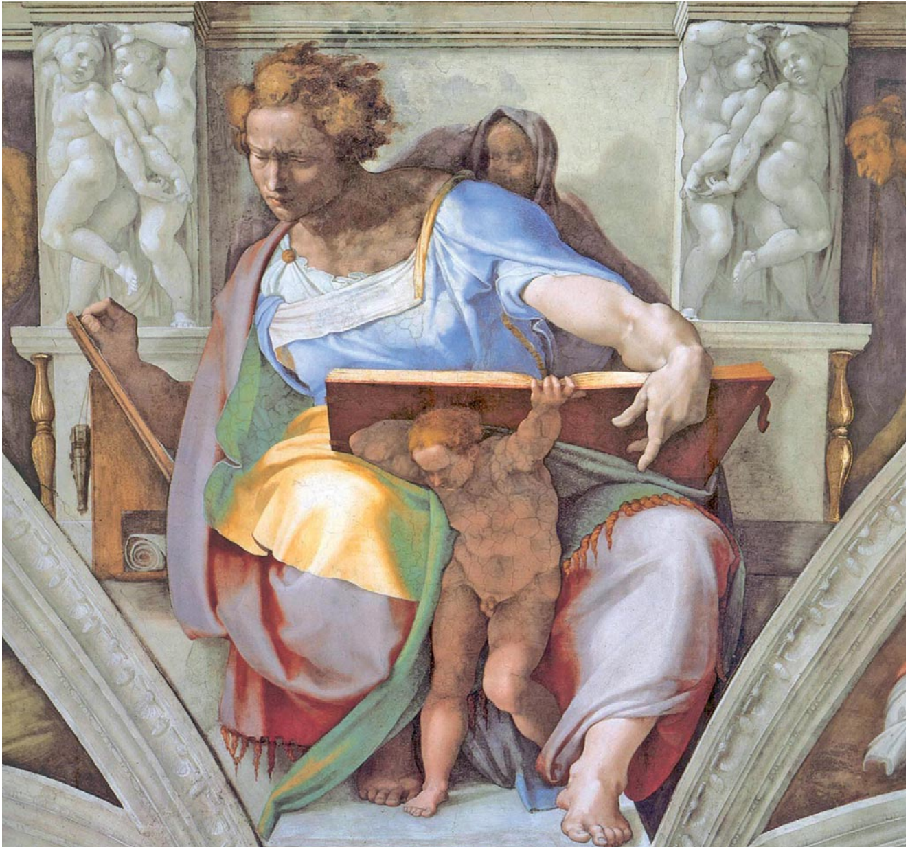
Figure 2. The Prophet Daniel, Sistine Ceiling.