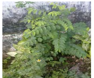
Figure 1. Sauropus androgynus (Indonesian names: katuk) [photographed by PIPOT research teams, at Batu, 17 June 2011]

All leaves were harvested in the morning, before 12.00 p.m, when the photosynthetic process was still happening. After harvesting, all leaves were transported into the laboratory, in the cold condition (-20 ^{\circ} C) for preserving their freshness.