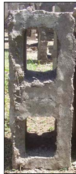
Figure 2. A Sample of 450x225x150mm Laterite/Sand Hollow Block