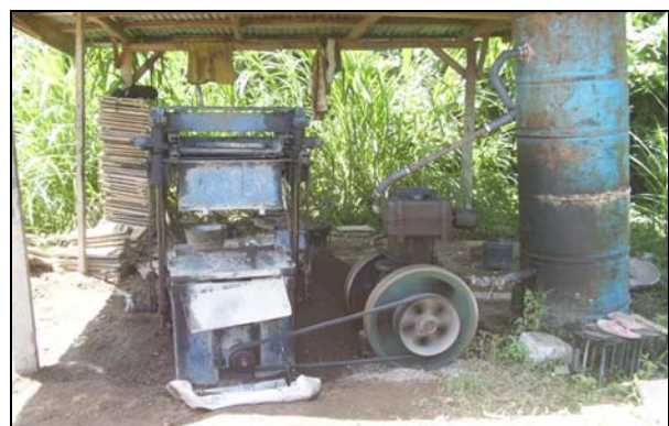
Figure 3. A Diesel Powered Engine Machine-Compacted Mould