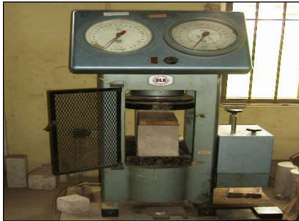
Figure 4. Crushing of A Block Sample in A Compression Machine

Actual compaction is achieved by bringing the “presser” down to bear on the cement/aggregate mixture in the mould below. This is done by the operation of the highest lever. A second lever turns off the vibration. The operation of the last lever, the longest on the right hand side slowly lifts the mould for a quick removal of the compact unit. Pressure applied is fairly constant.