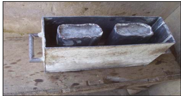
Figure 1. A Manually Operated Prefabricated Steel Mould Box

It operates on a motor placed underneath the wooden pallet upon which the mould rests. The diesel types incorporate the use of a fan belt fixed over the motor and a roller, which actually turns the roller. Actual vibration occurs when the fixture on the motor, a metallic mass, hits underside of the wooden pallet. The moulded unit is removed by the operation of the longest lever, which is normally on the right side of the machine.