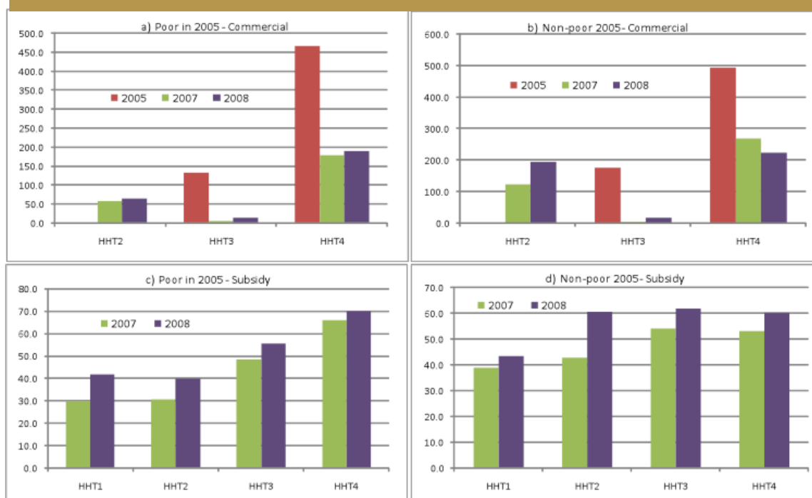
Figure 2: Household commercial and subsidy fertilizer by poverty status 2005 – 2008 (kg)

Note: HHT1 = Never bought fertilizer in all years, HHT2 = Never bought in 2005 but in 2007 or 2008, HHT3 = Bought in 2005 and either in 2007 or 2008 (intermittent buyers) and HHT4 = Bought in all years.