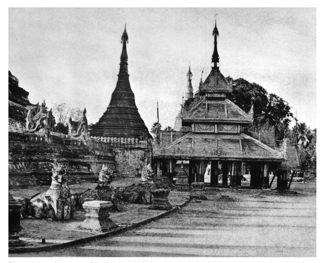
Figure 19.2: Northeast Sector of the Shwedagon in the late 19th century showing the Naundawgyi stūpa.

The expense of these lowered the frequency of their construction in Myanmar after the dethronement of Thibaw in 1885 and the cessation of royal patronage, but the tradition of vernacular wooden architecture seen for instance in the use of traditional forms such as the duyin or peacock chest finial and sein oh or diamond pot decorations in the long wooden covered staircases of the Shwedagon has continued along with the highly specific vocabulary of roof styles.