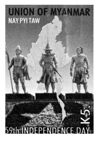
Figure 19.4 : Stamp for 2007 Independence Day with rulers of 11–18th century Myanmar on a golden outline of the country.

Similar sentiments of the present often reiterate this legacy, from the utterance of the Buddha that Shwedagon's Singutarra Hill was to shelter the Sacred Hairs to the replication of the Shwedagon at other locales. Uppatasanti pagoda at Nay Pyi Taw, for example, is built with the same form and but officially one foot lower (325 rather than 326 feet) than the Shwedagon. The legacy of royal place and capitals is also reified at Nay Pyi Taw in a row of imposing statues of Anawrahta, Bayintnaung and Alaungphaya. The unbroken lineage of Buddhist kingship from 11th-century Bagan to 16th-century Bago (Hanthawaddy) and 18th- to 19th-century Inwa (Ava)-Mandalay is recalled in these royal images, with their silhouettes projected against a floodlit sky and emblazoned on a golden outline of the country for commemorative postal stamps on the 59th Independence Day, 4 January 2007 (New Light of Myanmar 2008) (Fig. 19.4). These are two of many current innovations, notable for their effective use of portrait sculptures and graphics, to draw the country's royal and territorial history into the present. As illustrated by the complex circumstances set out in this paper, the 1853 occupation of the Shwedagon was a significant catalyst in a time of conflict and absorption for the cognisant use of the past and intertwining of archaeological and religious objectives now coming to fruition.