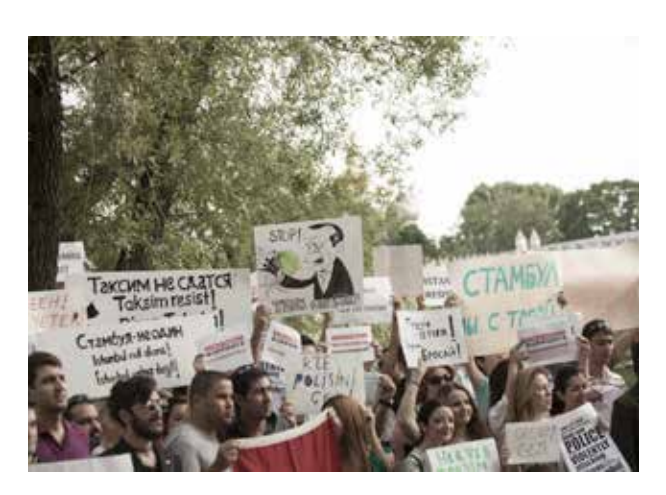
Protest in Moscow to support the Occupy Gezi demonstration in Istanbul, 1 June 2013.

I find it interesting with people commenting that Turkey isn't the same as Occupy [London]. What is fascinating is that we feel the same. The Turkish activists are writing to us and we are trying to sustain them and help them. So of course, everything is localized and what is happening is connected to the local struggles. But it's all concentrated in such a moment of time that there must be some connections and to me it's the practices in which it's happening. The fact that you have a camp and all the camps form in the same way. And you have a library, the school, the canteen; it's all the same (London, 12 June 2013).