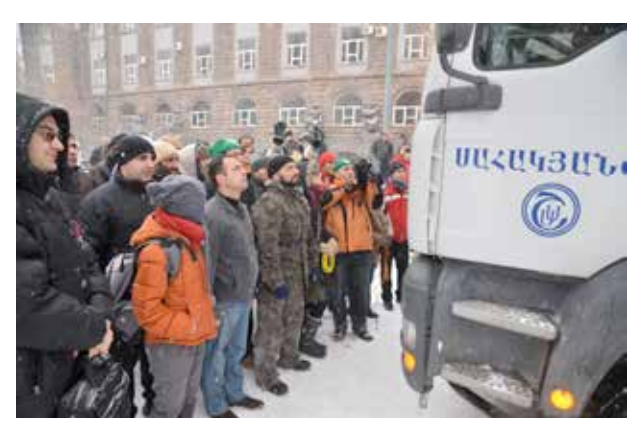
Occupy Mashtots Park protestors stopping a lorry on 16 February 2012, Yerevan, Armenia

I would call this activism an outburst period of the new generation which was not born and raised in the Soviet times. This generation is more open minded than the previous generation and obviously this new generation is going to have an outburst when it experiences injustices (Yerevan, 27 July 2013).