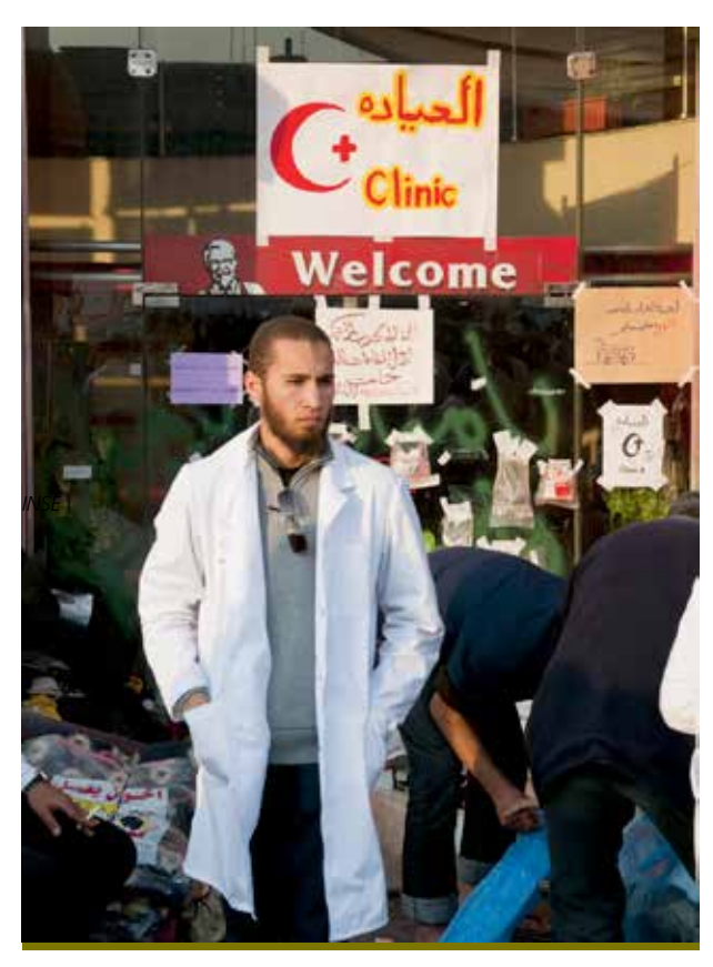
Clinic in Tahrir Square

sitting next to the very poor farmer. It was an amazing time; however it was full of delusion... During the 18 days in the square, it was a very nice time, everyone felt there is a huge movement of awareness everyone cares about politics and for this country [Egypt] to be the best country in the world. But that was to me a delusion. I believe it was a big delusion. There was no real deep thinking of a path for the revolution. No one knew what would come after Mubarak. No one even agreed upon this stuff (Cairo, 18 May 2013).