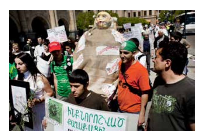
Occupy Mashtots activists participate in the funeral of "Mr Olig Garkhian" (ie, Mr Oligarch), 22 April 2011, Yerevan, Armenia

In Moscow, although the Occupy Abai movement embraced many practices and aspects of other Occupy camps including the general assemblies, canteens, open air lectures, etc, it did not have a clearly articulated agenda around social justice or indeed democracy largely because it brought together leftists, liberals, and nationalists into one camp who while sharing an anger with the ruling regime were also divided on developing a common strategy and agenda of demands. As one activist explained,