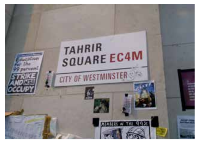
Sign from Paternoster Square in London, October 2011.

The global survey demonstrated that movements referenced each other for inspiration, with many a square around the world being called another "Tahrir Square" in honour of the Egyptian revolution.