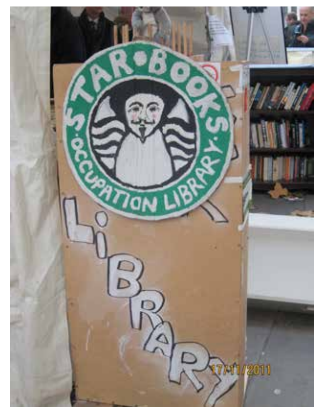
Occupy London Library, November 2011

While the mainstream media ignored the organisational aspects of the encampments, these were regularly reported by non-mainstream media such as blogs and forums and discussed by respondents in interviews. In these encampments horizontal organizational structures were instituted by protesters in an effort to avoid creating the hierarchal power structures they were protesting against. Strictly enforced methods for addressing the gathering meant that an academic and an unemployed labourer had the same amount of time at the microphone and the same opportunity to be heard. There were direct democracy parliaments where motions were proposed, discussed and passed or rejected, with minutes of the proceedings being published on the internet, as were the rules that governed how the working groups and assemblies were conducted. Any member of the occupation had the right to start a working group and any changes to methods of governance were voted on and decided through consensus decision making. Additional pastoral services like libraries, exercise classes, separate spaces for women and welfare provision were also set up to enable those camping to have a higher quality of life. These methods were adopted in Athens, Barcelona, London, Madrid, New York, and Toronto to give a few examples.