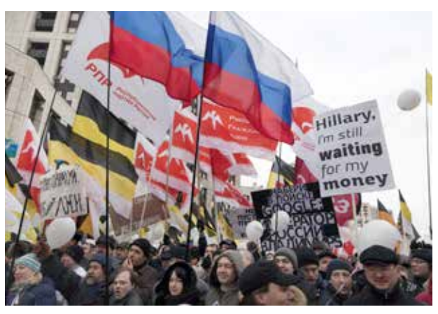
Protest from Moscow Sakharov Square, 24 December 2011