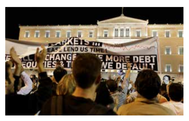
Protest in Syntagma Square, Athens 2011

were now people joining demonstrations who had been previously well-off. One respondent said, "This was the first time that people who had never before participated in demonstrations came out to protest (Athens, 11 April 2013). Another added, "For the first time in Greece, the older generation, people like my mother, went to protest" (Athens, 8 August 2012).