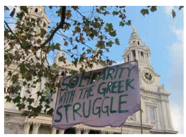
Banner in front of St Paul's Cathedral, London, November 2011.

the movements, despite their presence on the global stage through social media, were organized and propelled in a nationally-oriented manner, often in response to very specific government policies and social conditions. That being said, we cannot discount the impact that the visual representation of the protests and slogans had in inspiring other groups to come out onto the streets. A particularly pertinent and clear example of this is the way that the Arab Spring protests unfurled across the Middle East, with each subsequent uprising clearly motivated and stimulated by the previous.