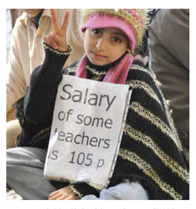
Young protestor in Cairo with placard about teachers' wages

The new situation, the young leaders as we can name them and the activists that emerged from the revolution, we are able to sit together and talk together. Yes we are different. We have different objectives maybe... But still we are able to talk together and I believe this generation will not take the country to some sort of confrontation like the early leaders that we are facing and we are actually suffering their bad mentalities and their negative dealing with situations (Cairo, 22 May 2013).