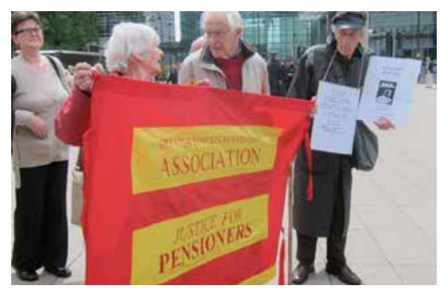
Members of the Greater London Pensioners' Association participating in a demonstration organised by Occupy London and anti-cuts groups in Canary Wharf, London 16 June 2013.

While acknowledging the importance of the generational aspect of the mobilizations, this is only part of the story and if we only focus on the protests as a generational outburst, we risk overlooking the fact that these concerns were shared more widely. In particular, with an ageing population in Europe, the precariousness of the elderly was of great concern to many activists we interviewed. The presence of protesters of all ages and varied economic backgrounds and even political affiliations (liberals, nationalists, socialists, anarchists, etc.) is proof that the protests were about much more. An important aspect of the 2011-12 mobilizations was that alongside experienced activists, there were new people, what some called "ordinary citizens" or "non-activists" who had joined the mobilizations. In this context it is more important to consider why "ordinary citizens" joined the mobilizations, and understand the relationship between them and the more experienced activists, than to focus exclusively on their age.