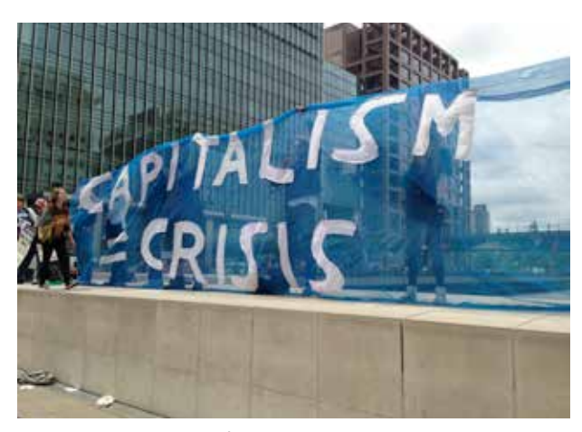
Banner "Capitalism = Crisis" from demonstration organised by Occupy London and anti-cuts groups in Canary Wharf, London 16 June 2013.

freedoms and an end to dictatorship and those demanding a move beyond merely procedural democracy, such as "Real Democracy Now" ("Democracia Real Ya!" in Spanish). Others highlighting the failure of the economic system at large and encouraging people to look beyond the current global economic crisis were also shared, with "It is not a crisis, it is the system" or "Capitalism is Crisis" being popular ones. These were particularly common amongst the protesters of the southern European nations, but also in London, which were undergoing a spate of severe austerity measures, especially deep cuts to public services and welfare, in response to the economic crisis.