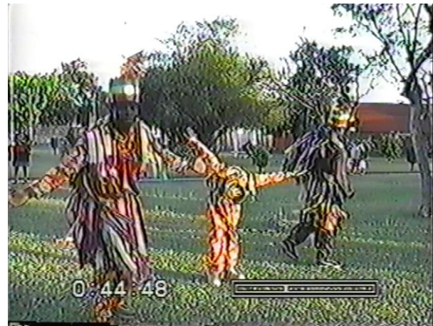
Fig.13 – The end

St. George once again boasts of his prowess as the “chief of all these valiant knights”, and is challenged by Slasher/King of Egypt, who has now become Salabim [sic] – a giant. As before, a whistle terminates their dispute, and more combative dancing takes place. This time there are also solo and three person figures, and much more stick clashing. At one point, they all drop their staves to form a line, and then led by St. George they dance around the performing area. Then there is another set of figures dancing in pairs. Towards the end, all the actors except St. George form a line, initially holding hands, and dance towards him a couple of times. Finally, they all line up holding hands, dance toward the camera and bow extravagantly. It takes two blasts of the whistle before everything ceases.