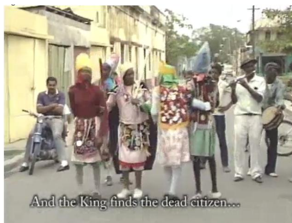
Fig.21 – Female characters (1 & 3 from left)

After the lines spoken by Primo, the dancing resumes (Fig.22) and it is probable that the rest of the play including the action previously described (Figs.14, 20, 21 and 23 below) would have unfolded in between these musical interludes (in accordance with the Roberts recording).