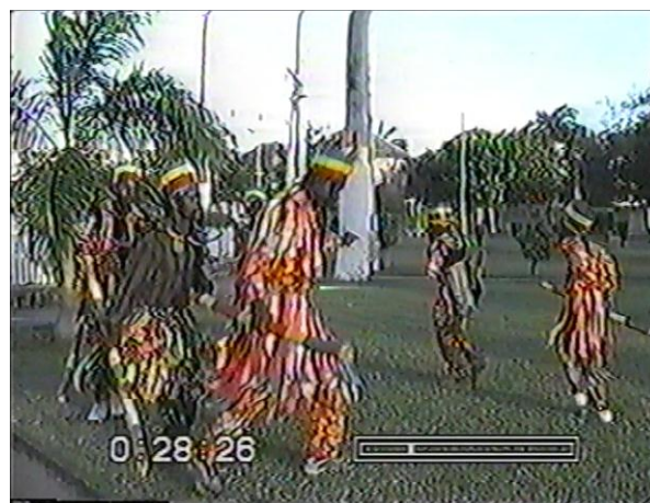
Fig.7 –Circling dance

On leaving the path, the musicians move to one side and back up towards a nearby tree. The dancers, meanwhile, initially dance in a circle, breaking into a sort of trot (Fig.7). They soon move into a line facing the camera and drop their staves to the ground while continuing to dance. The audience is not very apparent; just a few people under the aforementioned tree, although there may have been an audience behind the camera. There immediately follows a series of figures in which pairs of dancers spiral towards each other while dancing a particular move. These moves include, gyrating the hips suggestively, hopping on one leg with the other leg extended forward (Fig.8), a sort of backwards run, hopping alternately with the legs to the side to achieve a swaying effect, hopping on one leg while turning the other foot through 180 degrees as in The Twist , and so on.