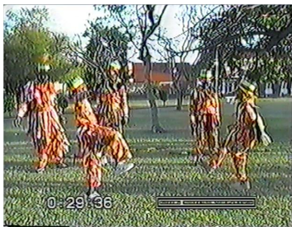
Fig.8 – Pair from the first dance

On leaving the path, the musicians move to one side and back up towards a nearby tree. The dancers, meanwhile, initially dance in a circle, breaking into a sort of trot (Fig.7). They soon move into a line facing the camera and drop their staves to the ground while continuing to dance. The audience is not very apparent; just a few people under the aforementioned tree, although there may have been an audience behind the camera. There immediately follows a series of figures in which pairs of dancers spiral towards each other while dancing a particular move. These moves include, gyrating the hips suggestively, hopping on one leg with the other leg extended forward (Fig.8), a sort of backwards run, hopping alternately with the legs to the side to achieve a swaying effect, hopping on one leg while turning the other foot through 180 degrees as in The Twist , and so on.