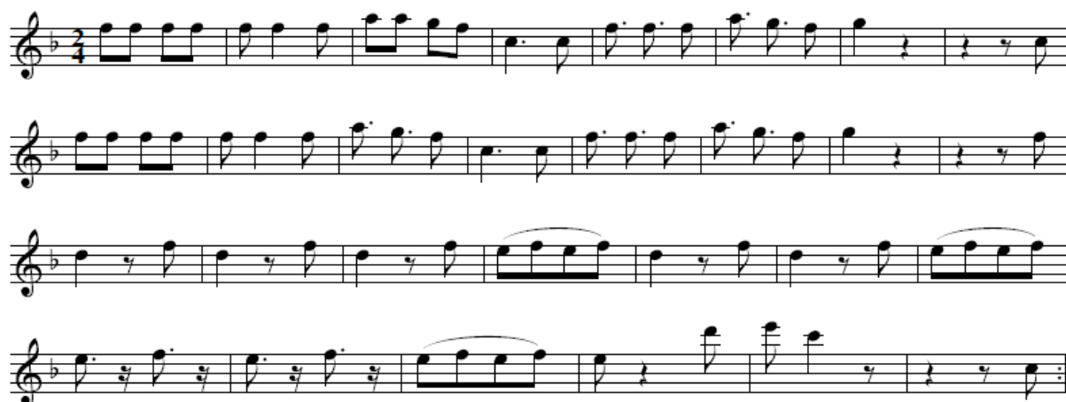
Fig.5 – Sample of phrases played by the Mummies' fife player. This is only a rough transcription, as befits the extemporatory nature of the music.

The actor dancers enter in procession along a path, taking a turn towards the camera before moving onto the grass to perform. The procession is headed by three musicians walking abreast as they play. They are dressed in everyday clothes and they play a fife, a snare drum and a bass drum. The bass drum strikes a steady beat, while the snare drummer maintains a continuous syncopated drum roll. The fife music consists of repetitive phrases drawn from a core of several different melodies, although these are freely varied with grace notes and other extemporisations (e.g. Fig.5).