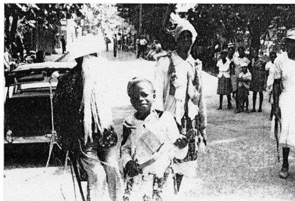
Fig.4 - Queen of Shava, St.Kitts

The scripts collected by Abrahams are quite close to the original Ewing text. They are slightly shorter, having suffered the usual attrition of oral transmission, but the sequence of lines is largely intact, apart from a couple of repetitions. Variations in the words also arise from oral transmission. A few variations are quite radical, and in some cases no longer make sense. It is our observation that the lines that involve unfamiliar concepts and/or use particularly archaic or convoluted language have suffered most, as in the following example spoken by Saint David: