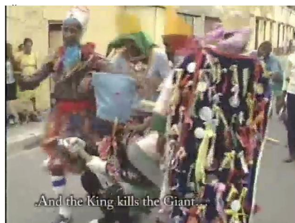
Fig.23 – The Giant killed

The costumes are richly decorated with mirrors and beads. It was remembered with pride by older members of the Cocolo community that they were able to create more impressive costumes with their greater resources in the Dominican Republic than was possible in their islands of origin.