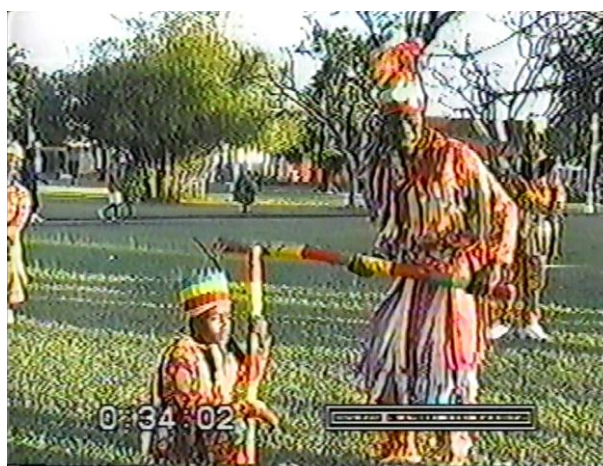
Fig.11 – The fallen Black Prince of Paradise

This time there is no introductory round of stick clashing before the speeches commence. St. George announces the death of the Black Prince of Paradise, signals for one of the boys to kneel in the middle of the circle, which he does with his staff placed vertically on the ground (Fig.11), and then calls for him to be taken away. The delivery continues with his habitual stick clashing with other cast members after every line or two. The King of Egypt (the actor who was Slasher earlier) enters, seeking his son. St. George gives him the bad news. Their dialogue becomes a dispute (Fig.12), during which the Black Prince of Paradise rises back into line, and at the point where a combat would ensue, the whistle blows again for another round of dancing. In this case the dance incorporates two short stick clashing duels. A whistle ends the dancing.