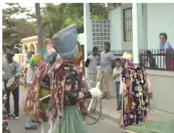
Fig.16 – Lining up in front of a house

“Mummies is a game that has a cast of a Giant, a Doctor and a King. It so happens that the Giant kills a citizen who is walking on a bridge... And the King finds the dead citizen... And he wants the Giant, as an order to bring to life the dead... In the middle of this, a Doctor, in a horse, appears... And the Doctor gives a medication to the dead that is already dead... And bring him to life! And they fight clubbing each other... And the King kills the Giant... In between dances, they do different choreography... It is very beautiful!”