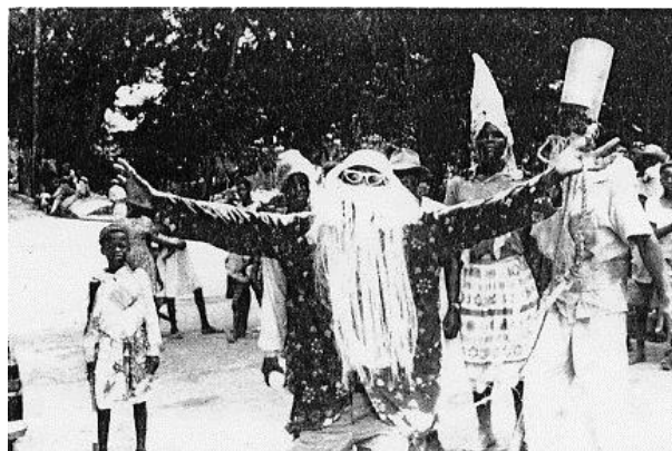
Fig.3 - Father Christmas, St.Kitts

dressing according to part. The other characters, however, wear fairly simple nonrepresentational costumes, covered in handkerchiefs or pieces of cloth, with prominent headgear of various shapes. A couple of these hats are quite tall.