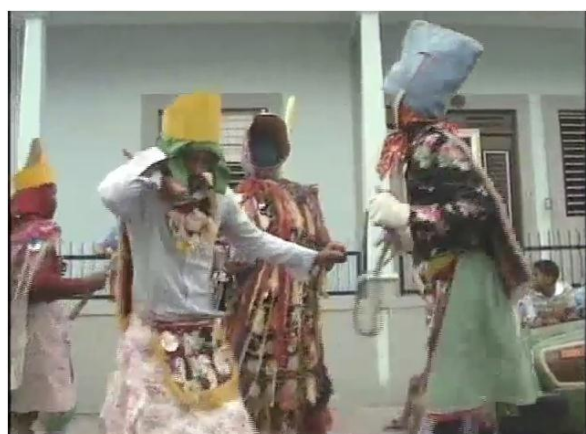
Fig.22 – Dancing resumes

After the lines spoken by Primo, the dancing resumes (Fig.22) and it is probable that the rest of the play including the action previously described (Figs.14, 20, 21 and 23 below) would have unfolded in between these musical interludes (in accordance with the Roberts recording).