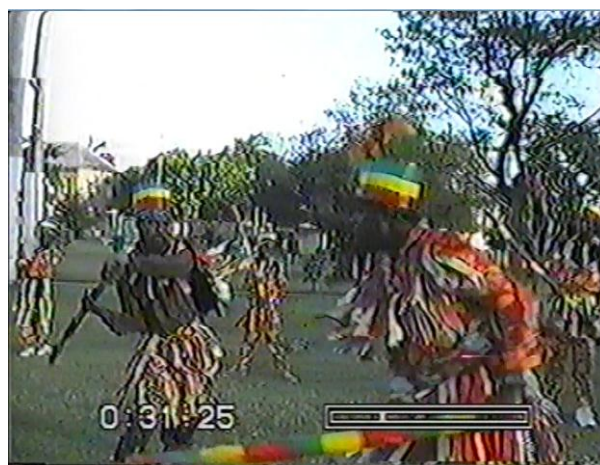
Fig.9 - St. George and Slasher clash staves

The end of the dancing is signalled with a blast on a football referee's whistle. The musicians stop playing, and the actors pick up their staves and form a semicircle. The first actor (named St. George later in the play, but here with the lines of St.David quoted above) goes round all the other actors in no apparent order and gives their staves a mighty thwack with his own. He then declaims his speech, issuing a challenge to the "bravely soldier", which is answered by