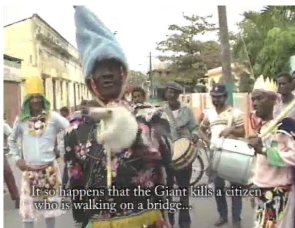
Fig.20 – The Giant