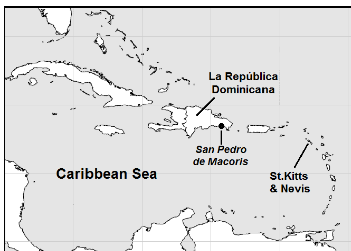
Fig.2 – St.Kitts-Nevis within the Caribbean

The population of about 51,000 is predominantly of African descent. 1 There is notable Kittitian émigré community in the nearby Dominican Republic on the island of Santo Domingo. This community is now assimilated with the local population, with the younger generations speaking Spanish rather than English, although they retain a distinct identity under the name of ‘Cocolos’.