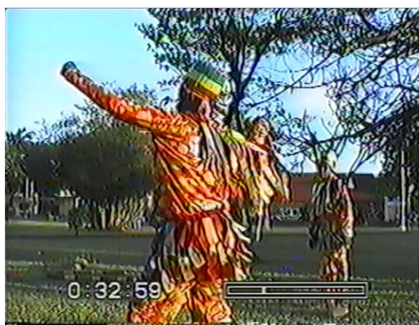
Fig.10 – Second dance - Gyration

Although this is a classic challenge dialogue, there is no fight, except for the ubiquitous clashing of staves mentioned above (Fig.9). The end of what we may call Act One is signalled by a short toot on the fife. The music starts up. The actors drop their staves to the ground, and another series of dances by pairs of actors takes place (Fig.10). This likewise is terminated with a blast of a referee's whistle, and the actors retrieve their staves.