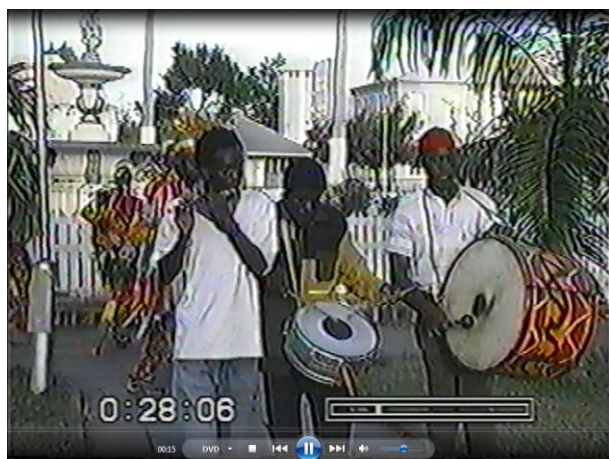
Fig.6 – Entering the square