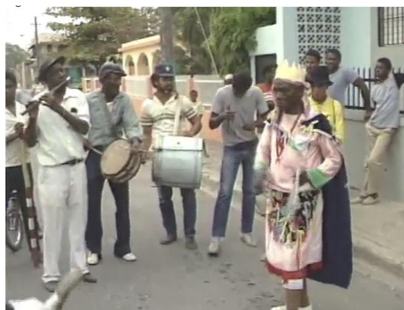
Fig.17 – The band