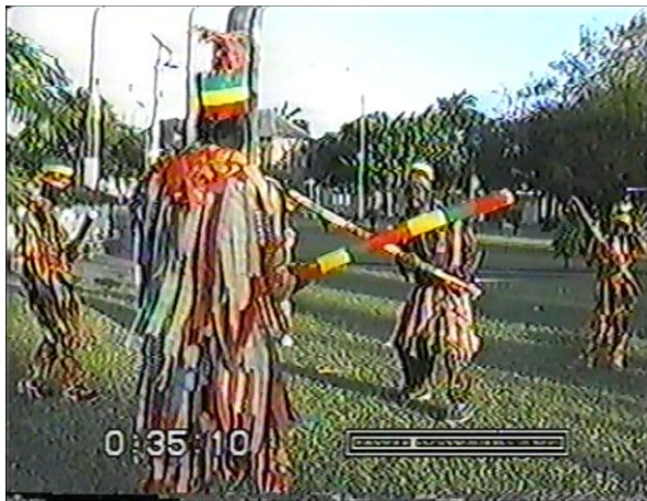
Fig.12 – King of Egypt disputes with St.George