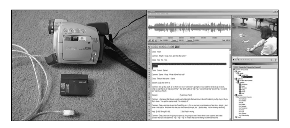
Figure 2 Digital video recording equipment: video camera with firewire computer lead, mini DV cassette and Transana transcribing software