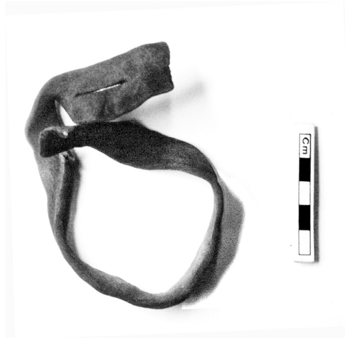
Figure 4. Torn skin strap, archive number 94.837.

of leather, which is stitched to the bottom edge, turned over and sewn onto the reverse to create an invisible hem that would not stretch out of shape. Another edge technique is small fringes cut 2-4mm deep and 3-5mm apart around the thumbhole of some of the hand-leathers (94.895).