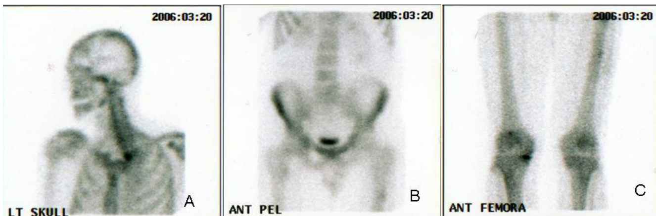
Figure 2 Technetium bone scan. No significant uptake in the skull (a), spine and pelvis (b), and proximal femora (c).

cases [6-9], to be insensitive to myxoid liposarcoma. Schwab et al. [8] have shown that even PET scans lack sufficient sensitivity to detect spinal involvement in this disease and recommended the use of total spine MRI when screening for metastases in MLS patients. Because bone secondaries are not common in soft tissue sarcomas, skeletal staging would not be routinely performed in many centres. Furthermore, relying solely on CT as a staging tool in these cancers might result in a significant number of metastases being missed. MRI, on the other hand, is an extremely sensitive tool to bone marrow replacement by abnormal tissue, as the high contrast between fat (marrow) and water (tumour) demonstrates metastatic lesions at an early stage [10]. We believe that whole-body MRI may be a more appropriate staging investigation of this particular tumour with unique clinical features. Because