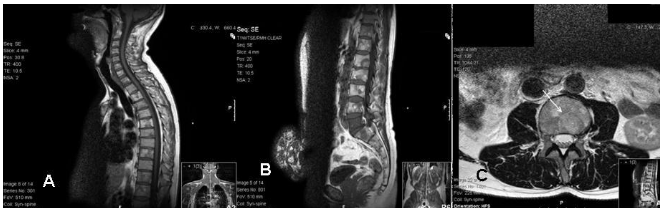
Figure 3 Diffuse abnormal bone marrow signal throughout the spine. Note multiple lesions with high-signal centres on T1W, reflecting the myxoid/fatty nature of the deposits. (a) Sagittal T1W MR image of cervical and thoracic spines. (b) Sagittal T1W MR image of lumbosacral spine. (c) Transverse section T2W MR image in L3.

our patient was initially asymptomatic, there was no way to detect the metastatic bone lesions and no reason to suspect they were present, and this may explain the late diagnosis. We do not know when skeletal lesions first occurred, as no spinal MRI was obtained between initial diagnosis and 2005. In addition, all other surveillance imaging investigations were negative. Ishii et al. [6] have reported two cases of relatively early bone metastases (2 and 4 years latency) not detected by bone scans. They attributed the normal accumulation of radiotracers to the likely diminished metabolic bone activity. Other authors have suggested that the myxoid stroma may prevent labelled glucose from reaching cells in sufficient quantity to be detected by the scanner [8].