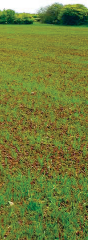
Figure 1: Problems encountered

Problems associated with reduced or no-tillage practices in organic farming systems based on farmer surveys and interviews in England