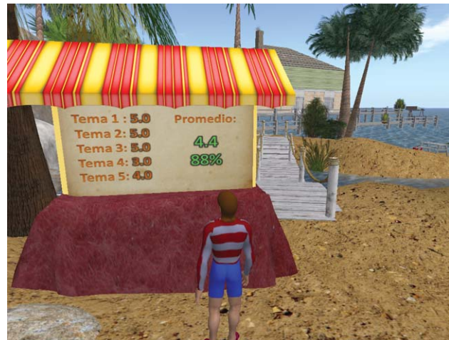
Figure 6. VR environment showing results to users.

The SUMI method is validated through the International Standard ISO 9241-11, and it consists of 50 multiple-choice questions, rated on a 3-point Likert scale in which the participant selects one out of three possible options: Agree , Disagree , or Don't Know (Sumi, 2017; Debevc, Stjepanovic, & Holzinger, 2014). (The survey can be retrieved from: http://sumi.uxp.ie/en/ .) After the remote visitor takes the virtual tour, the participant completes the survey through a standard database that spawns a table with the results. If the mean score for such results is greater than or equal to 50, it can be said that this aspect has an above average value (Sumi, 2017;