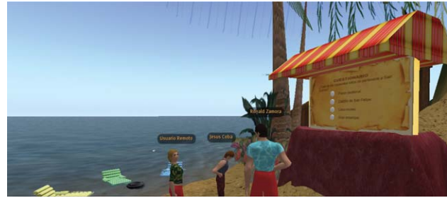
Figure 5. Avatars interacting to select a response about the virtual heritage tour.

To assess the immersive environment usability in the virtual tour, a previous meeting took place to explain the platform's usage. After this, participants remotely logged into a server with software like WampServer to get on the tour's immersive environment. Each participant from different locations used computers with internet access and viewer software capable of displaying 3D environments like Singularity (2017) or Firestorm (2017) to interact through the 3D VR, which included answering some questions about the heritage of San Andrés Island. Finally, users completed an environment usability evaluation through SUMI's platform.