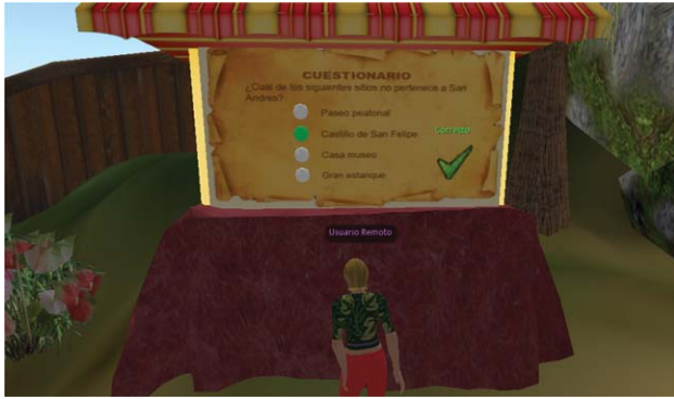
Figure 4. Avatar choosing correctly an answer in the questionnaire.

Figure 5 illustrates three remote visitors interacting among themselves to agree on an answer to the questionnaire regarding the virtual tour.