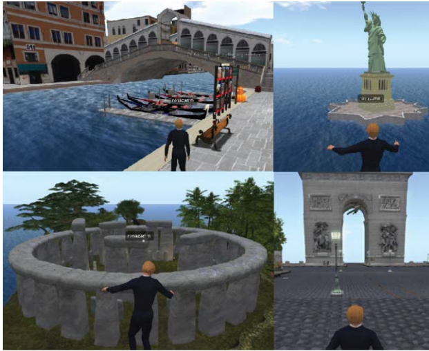
Figure 1. Example of four places represented in a virtual heritage: Venice, Statue of Liberty, Stonehenge, UK, and Champs-Élysées.

laboration. For this reason, OpenSimulator is used to implement the virtual tour.