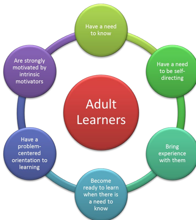
Figure 2. Six assumptions about adults as learners [25]