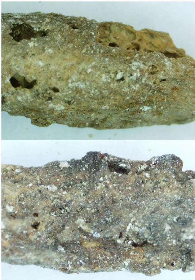
Figure 2. The phalanx with suspected pathology.