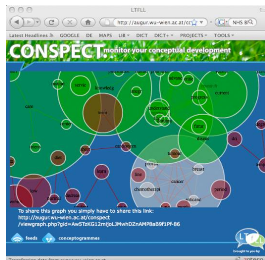
Figure 2. Example comparison topic representation vs. predefined reference model.