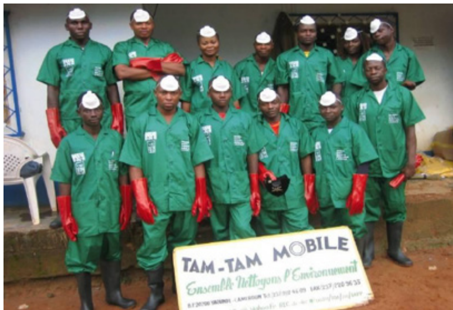
FIGURE 2: The TAM Tam Mobile team, Yaoundé.

The project was then finalized, obtaining the necessary authorizations, assessing the restoration works and selecting the furniture in such a way that the space created can provide different types of services: bar, restaurant and catering, services that can attract and welcome diversified people and that, after an initial start-up phase, facilitate economic autonomy; consultation of brochures, books and magazines at different levels of in-depth analysis of envi-