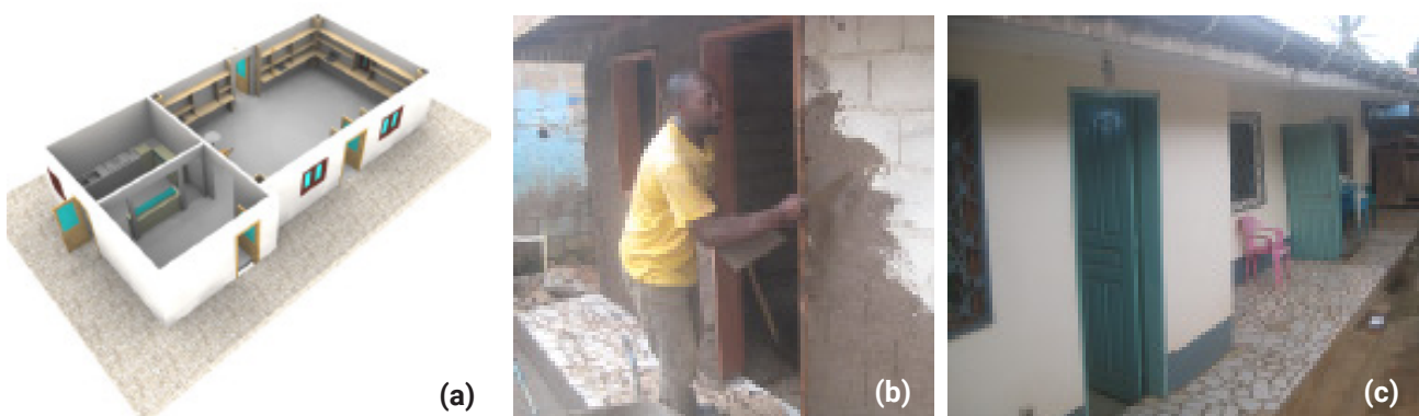
FIGURE 3: Different phases of the literary cafe: a) the project (courtesy of arch. Rosalba Giani), b) the restoration works, c) the realisation