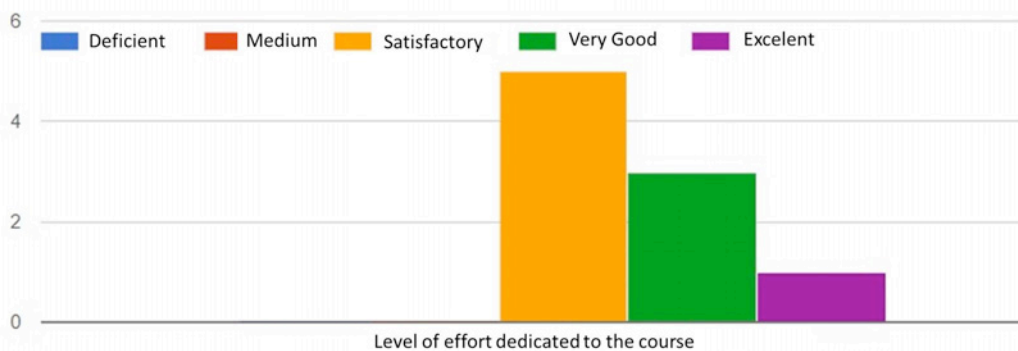
Figure 6: Level of effort. Assessment of students based on the surveys.