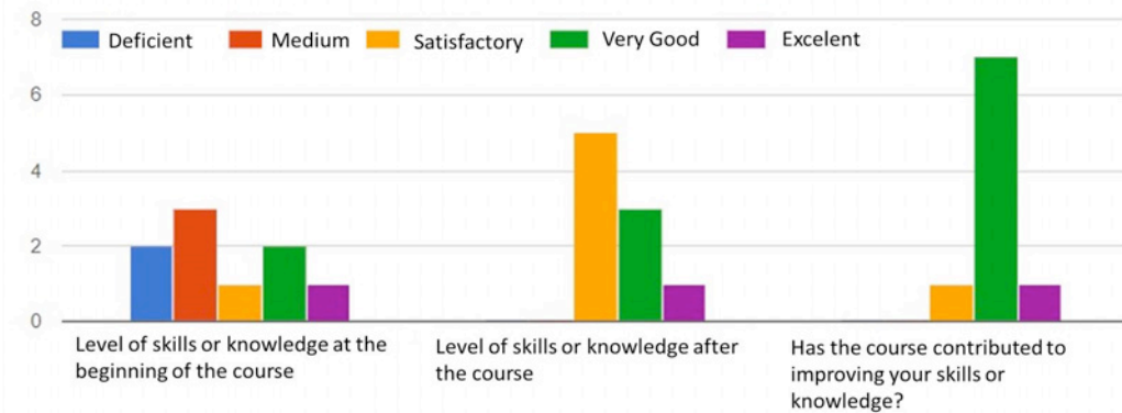
Figure 5: Acquired knowledge. Assessment of students based on the surveys.

Last, but not least, is the result obtained with the surveys on the assessment of the level of effort dedicated to the signature. This data is not trivial and especially in the last years of the Degree, where fatigue and haste to finish studies are counterproductive in learning, since students sometimes put the final result in the subject without considering their acquisition valuable or not of competences. The level of effort considered most is satisfactory, Fig. 6.