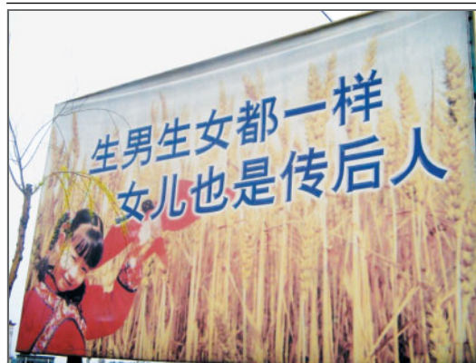
Figure 2. Billboard in Hebei Province Promoting Girls.

The advertisement reads, “There’s no difference between having a girl or a boy — girls can also continue the family line.”