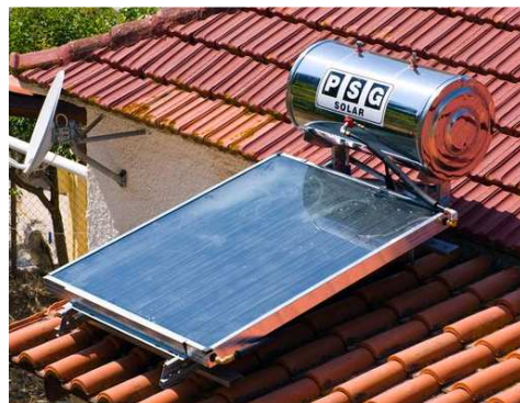
Figure 1.7.1 : Solar Water Heating System on rooftop